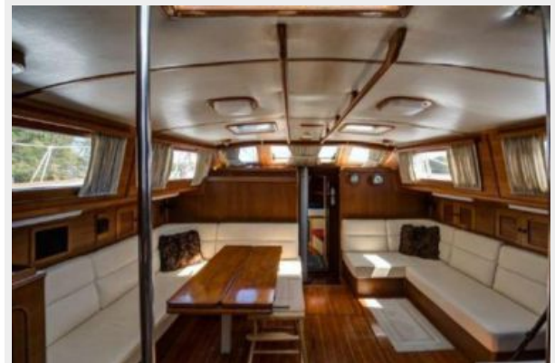
MAIN SALOON FWD