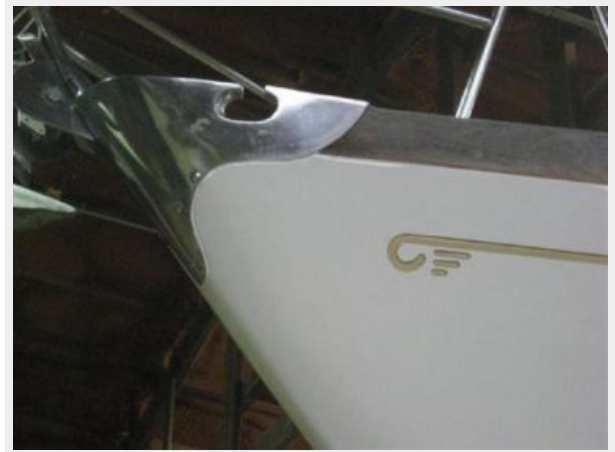
Starboard side Nav Area, Berths, Storage