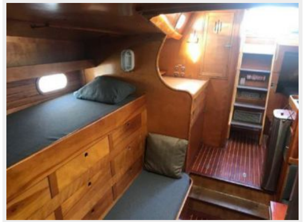
V-Berth with storage and forepeak access