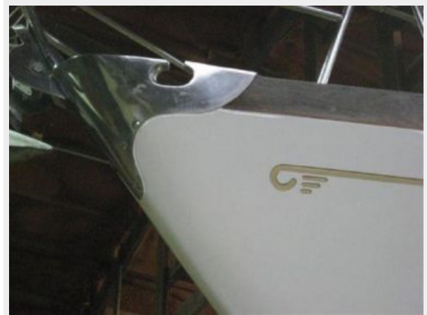
Starboard side Nav Area, Berths, Storage