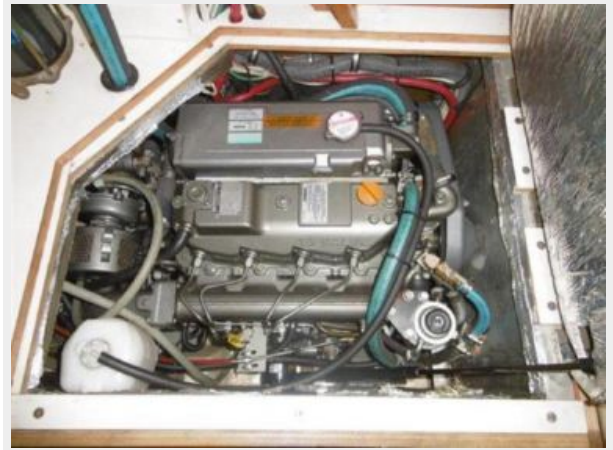
Catalina 470 with many upgrades