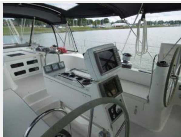
Twin wheels two chartplotters and lots more