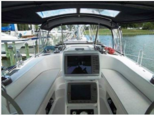
Comfortable cockpit with new cushions