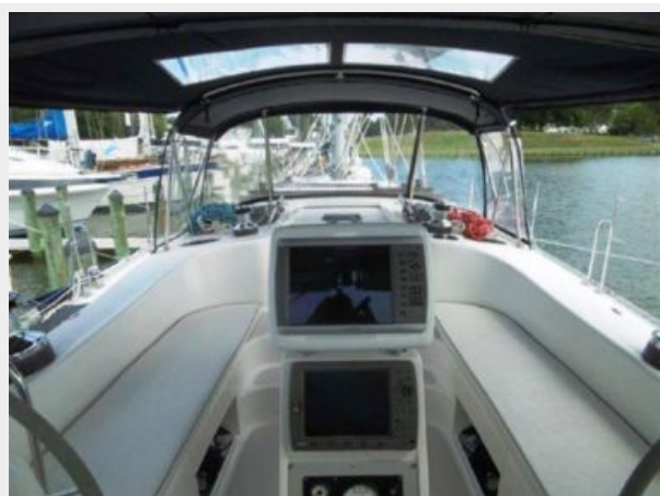
Comfortable cockpit with new cushions