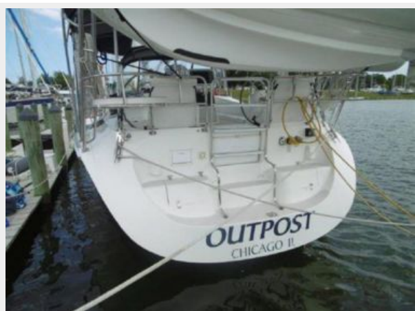
Transom provides easy access in and out of the water and dinghy