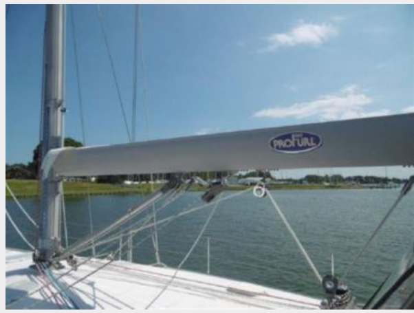
Upgraded ProFurl inboom mainsail for better sail shape