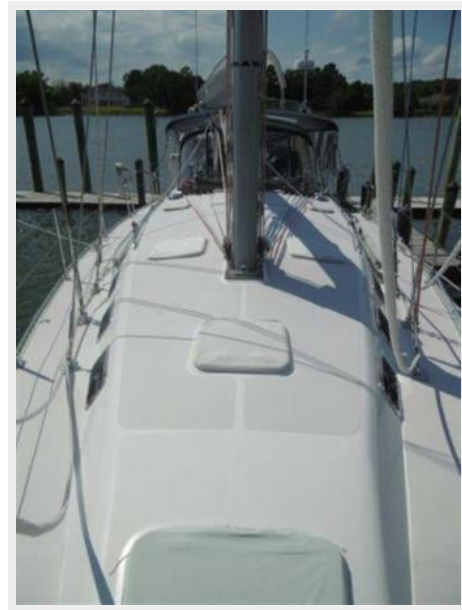
Catalina 470 deck with hatch protective covers