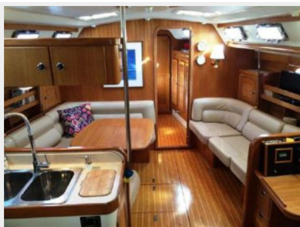
Large open salon with new upholstery