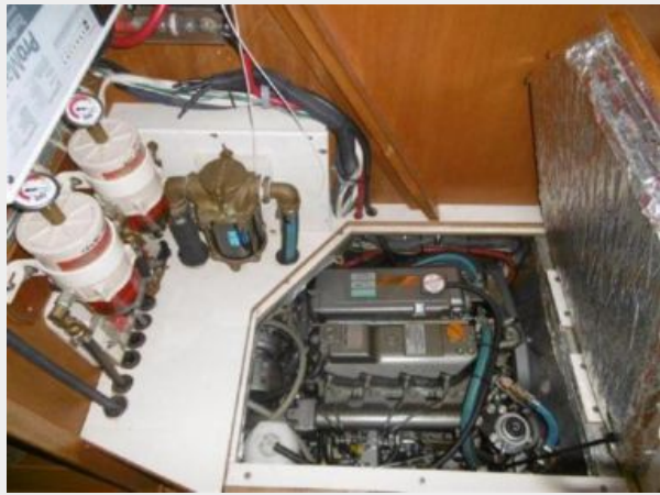
Catalina 470 engine area easy to access