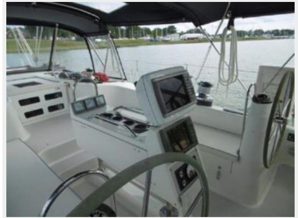
Twin wheels two chartplotters and lots more