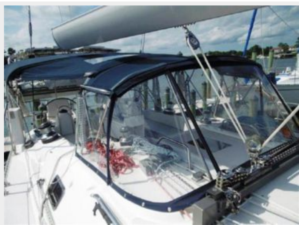
Dodger Bimini and connector