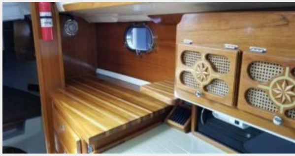
BUTCHER BLOCK WORK STATION