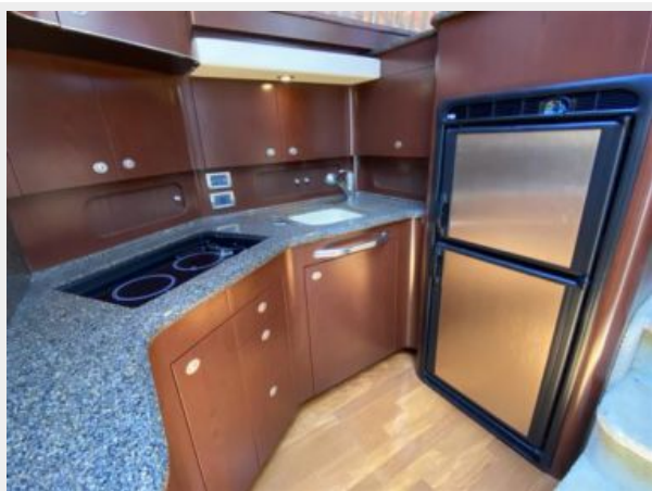
Salon Facing Aft