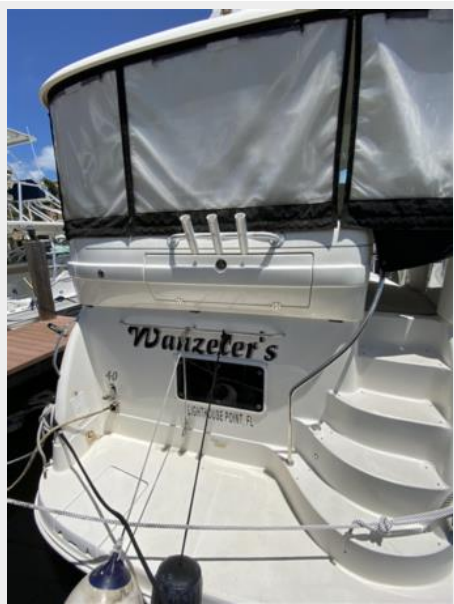
Enclosed Main Deck