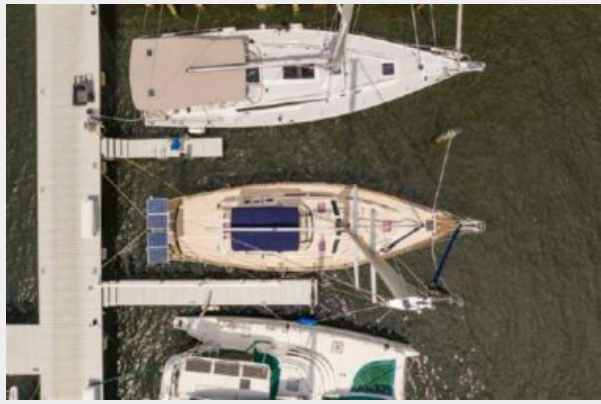
Aerial view of Hometown Girl