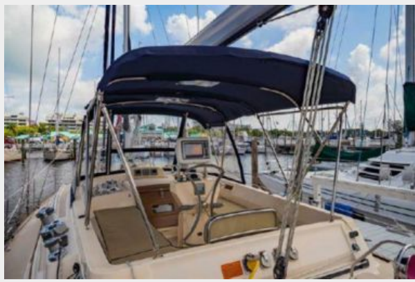
Dodger and bimini with connecting panel, SS frame and SS handrails (2019)