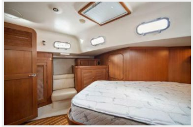
Access to stern storage