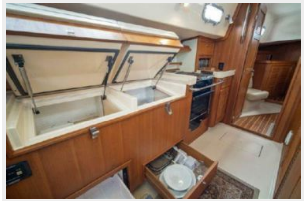
Refrigerator and freezer (2 x Frigoboat Frigomatic K50F and FW Pump) (2019)