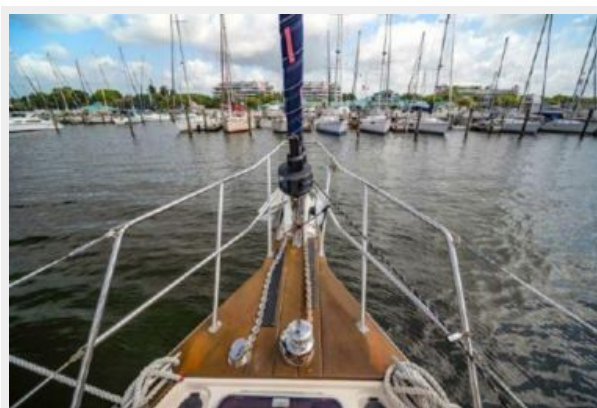
New bow pulpit (2019)