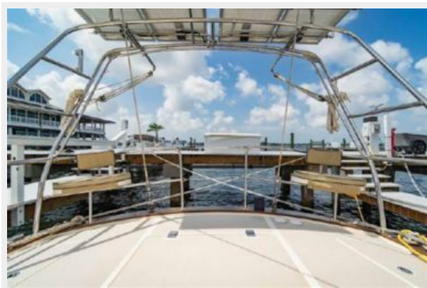
Kato stainless steel arch with davits and outboard lift (2019)