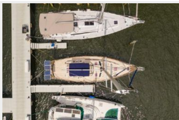
Aerial view of Hometown Girl