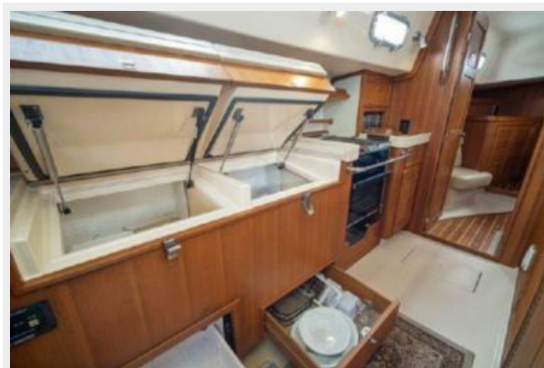
Refrigerator and freezer (2 x Frigoboat Frigomatic K50F and FW Pump) (2019)