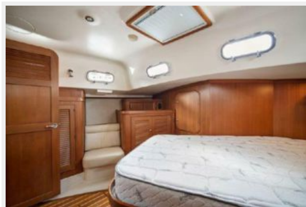
Access to stern storage