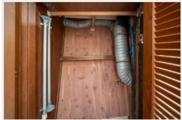
Fwd cabin cedar lined locker