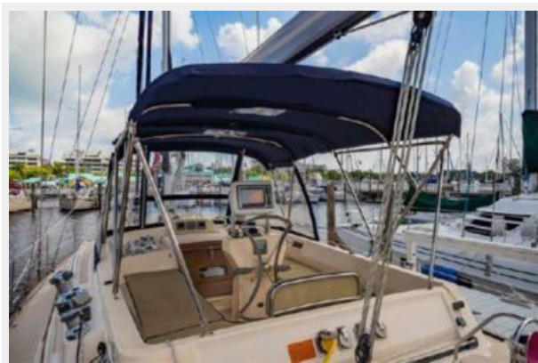
Dodger and bimini with connecting panel, SS frame and SS handrails (2019)