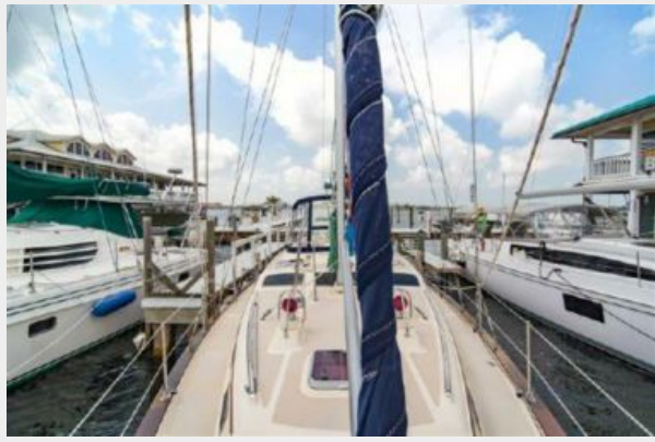
Self-tending, furling staysail on a Hoyt boom