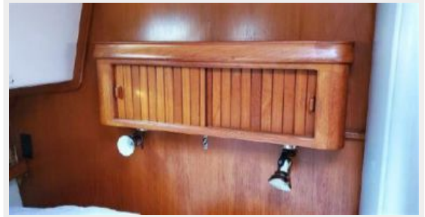
Owner's Stateroom Cabinet