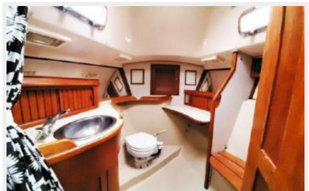
Owner's Head Wide