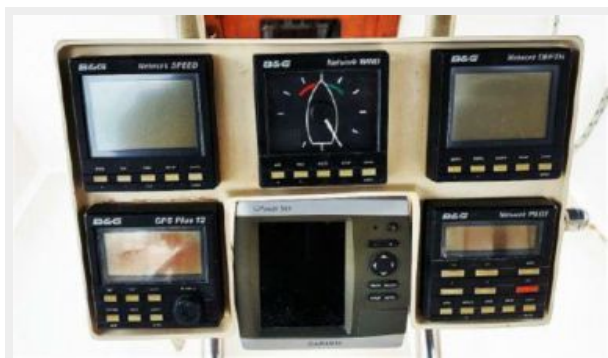
Electronics at Helm