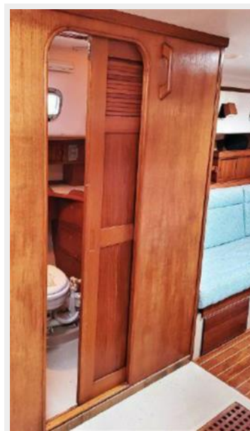
Head Pocket Door