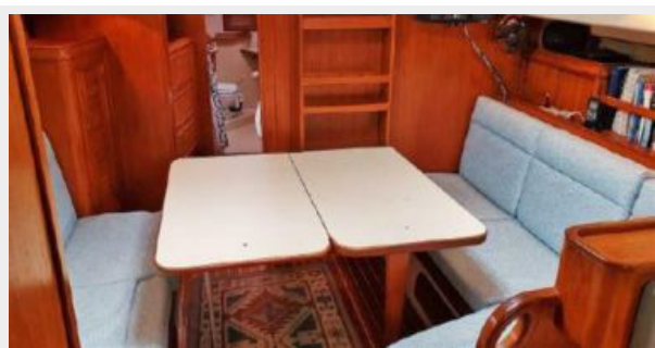
Salon Full Table