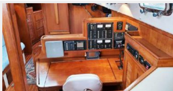
Nav from Galley