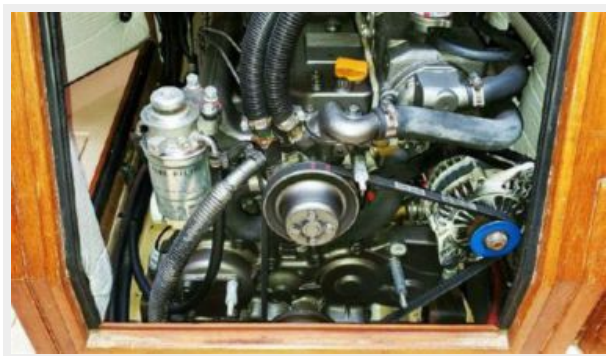
Front Engine Access