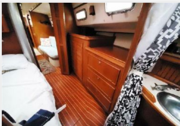
Owner's Stateroom Port Cabinetry