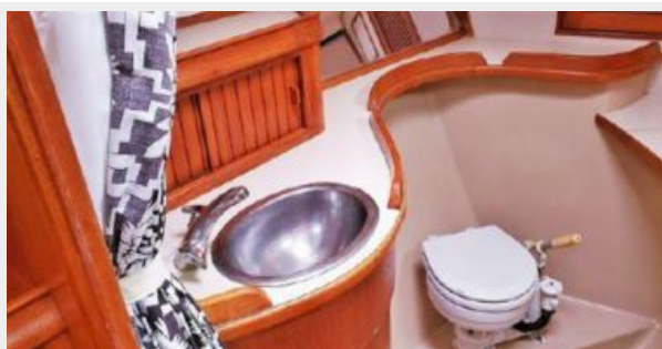
Owner's Head Sink and Storage