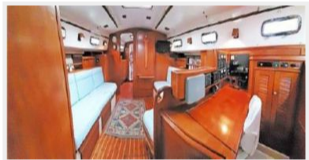
Salon from Nav