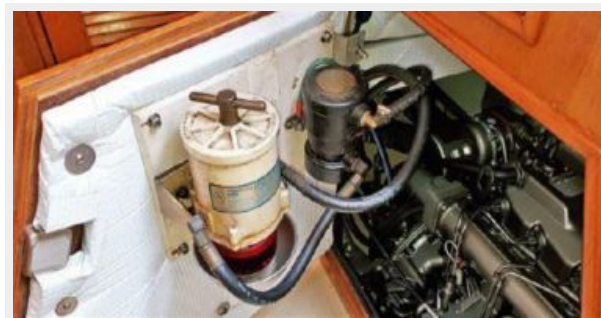
Fuel Water Separator