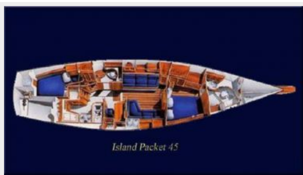
Island Packet 45 Layout