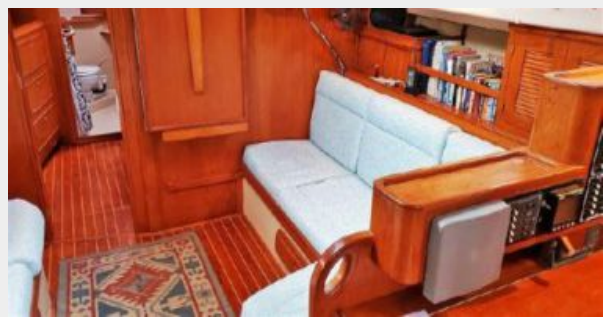
Salon Table Up