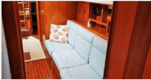
Port Settee from Fwd Cab