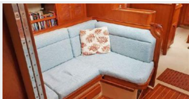
Stbd Settee from Fwd Cabin