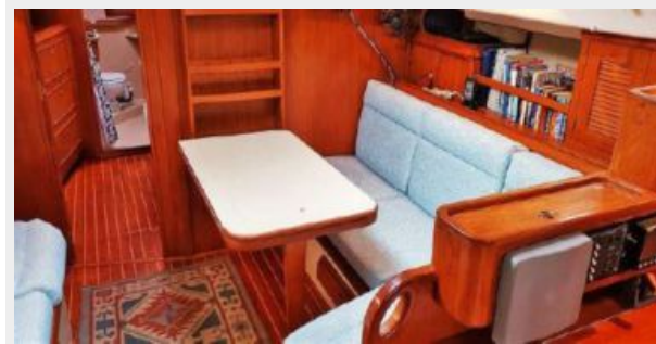
Salon Half Table