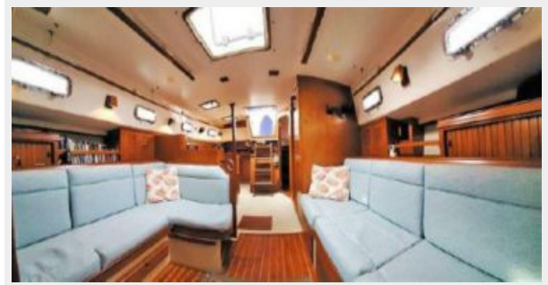
Salon from Companionway