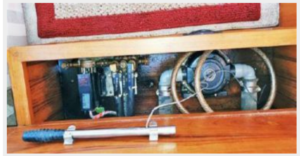
Oil Change System