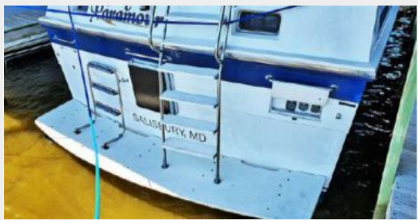
NEW Swim Platform