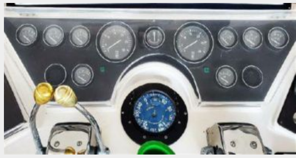
Flybridge with Full Gauges