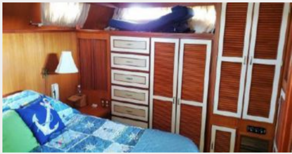
Owners Stateroom Cabin Detail