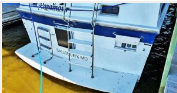
NEW Swim Platform