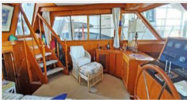
Salon and Entry