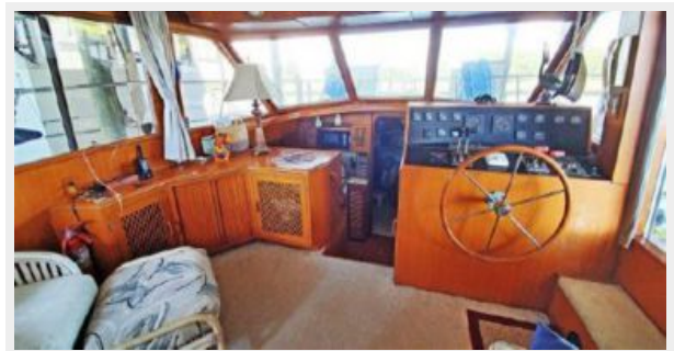
View from Salon