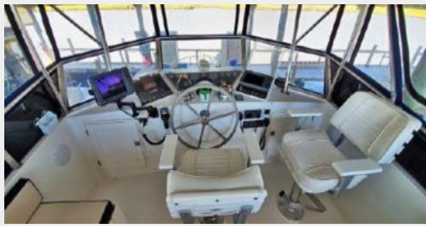
View from Flybridge