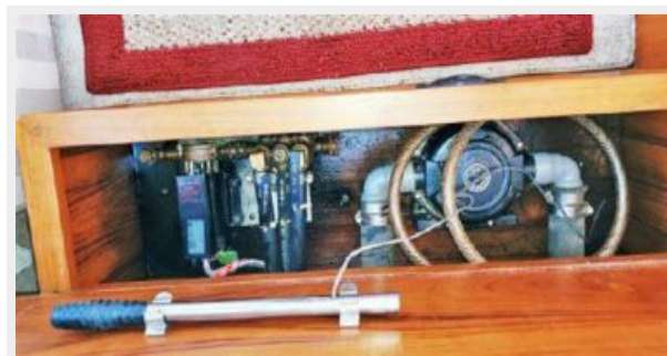
Oil Change System