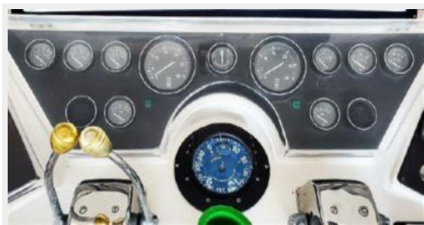
Flybridge with Full Gauges