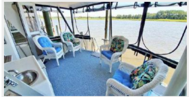
Aft Deck Full Enclosure