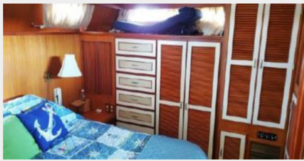
Owners Stateroom Cabin Detail