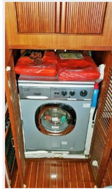
NEW Washer/ Dryer