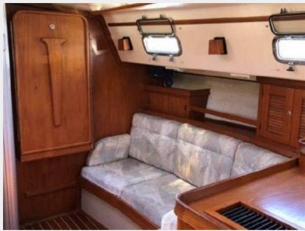
Starboard salon settee converts to a berth