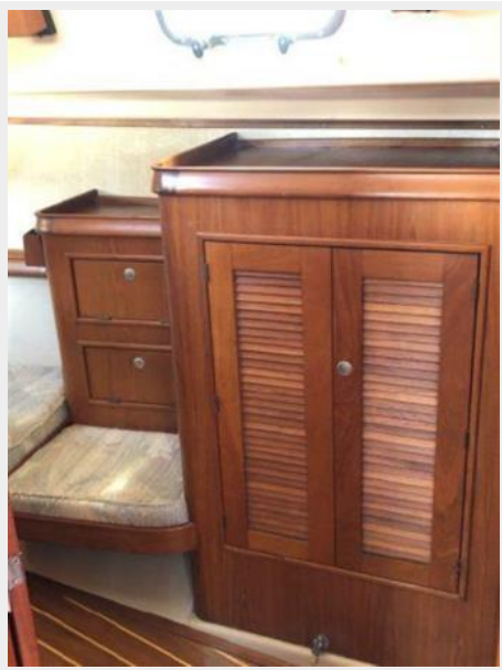
Forward stateroom storage