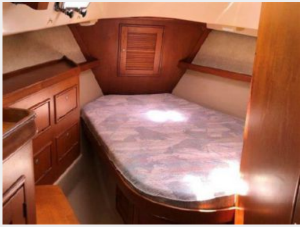
Forward stateroom berth