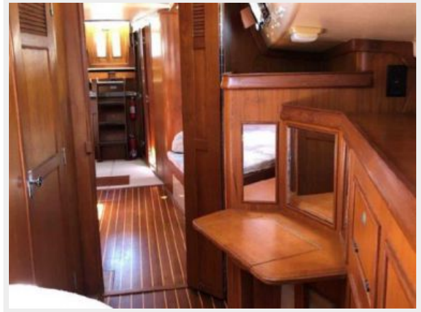
Forward stateroom looking aft