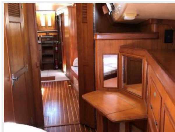
Forward stateroom looking aft