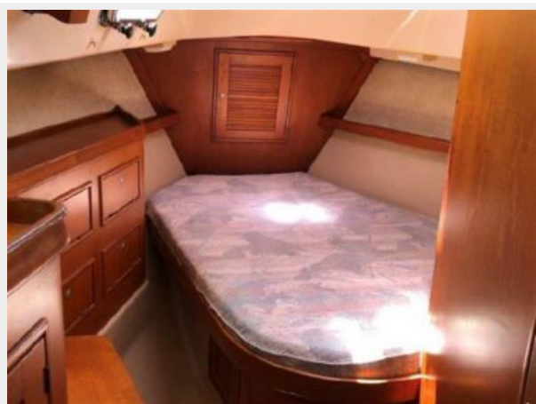
Forward stateroom berth