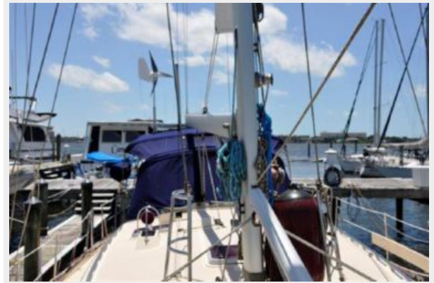
LOOKING AFT AT DECK