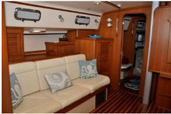
MAIN SALOON PORT SIDE