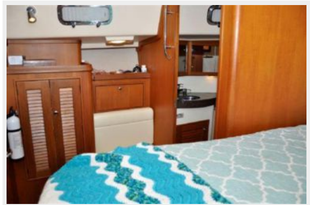
OWNER'S SUITE TO PORT