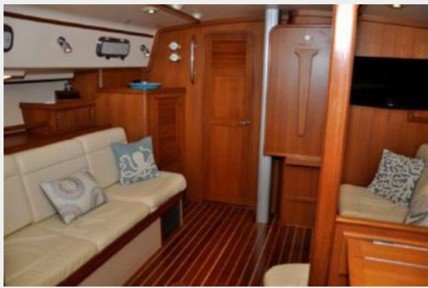
MAIN SALOON LOOKING FORWARD