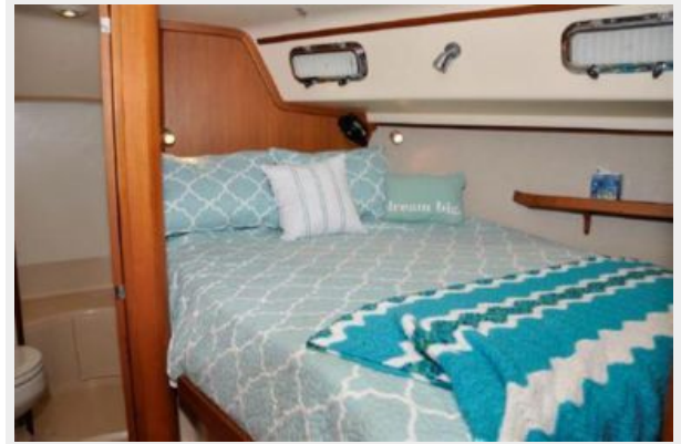
OWNER'S SUITE FORWARD