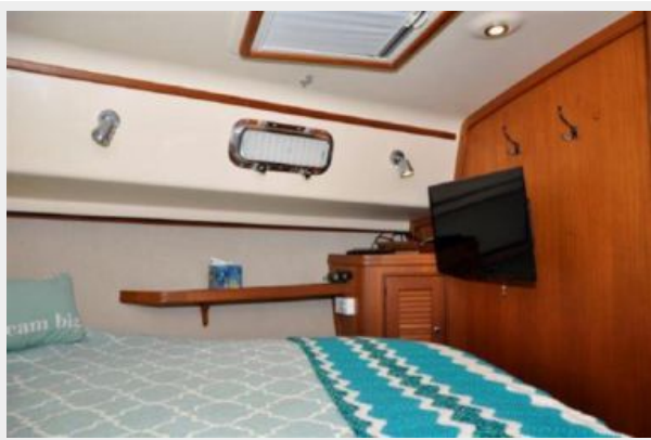
OWNER'S SUITE TO STARBOARD