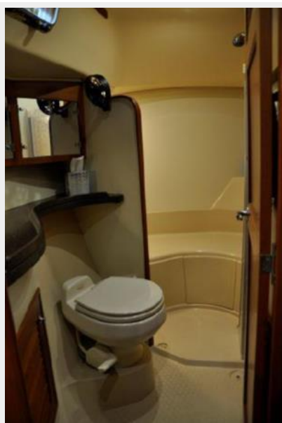
OWNER'S SUITE HEAD, LOOKING FORWARD