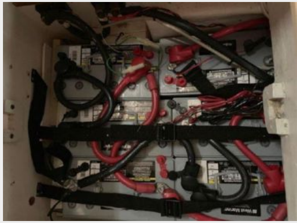
HOUSE BATTERY BANK