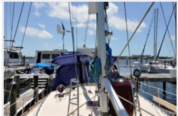
LOOKING AFT AT DECK