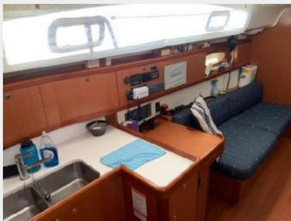
Port Saloon showing Nav table