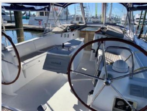
Spacious, well laid out cockpit