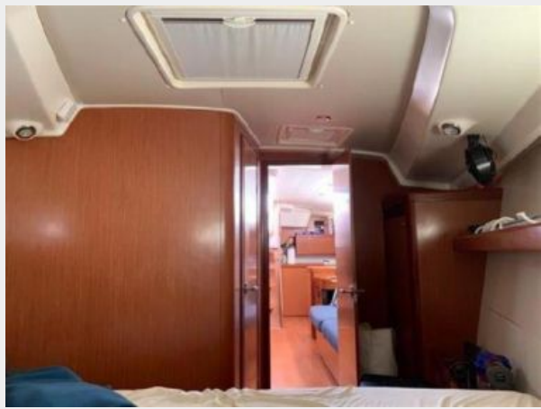
Looking aft from forward cabin