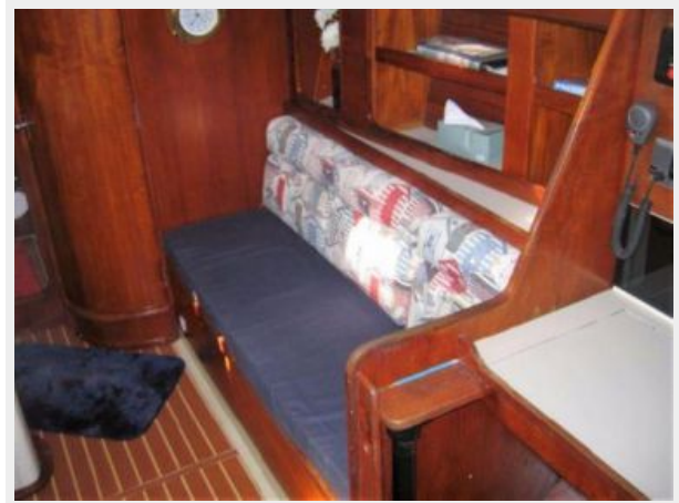
Looking at Starboard Side of Saloon