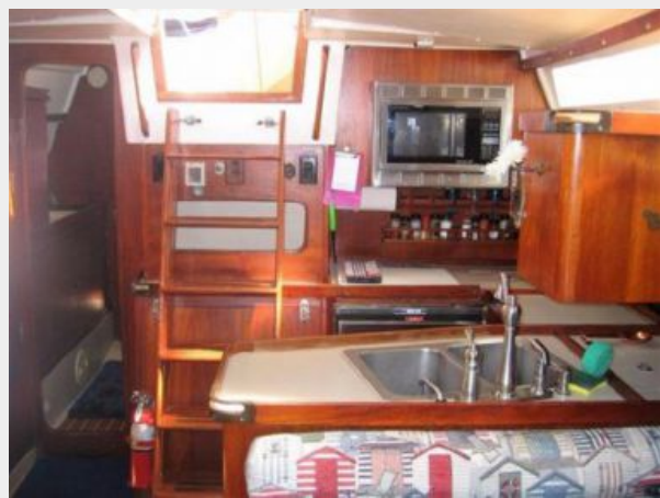
Saloon Looking Aft to Companionway