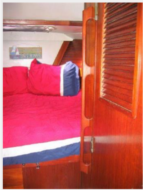
Aft Cabin Port Side