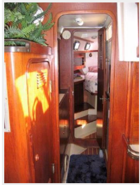
Saloon Looking Forward