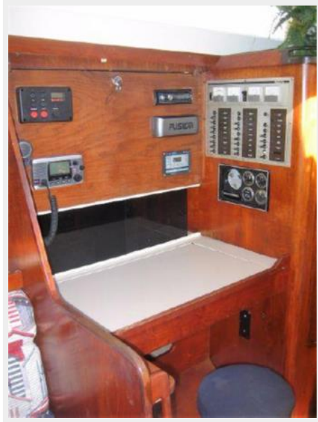
Nav Station & Electric Panel