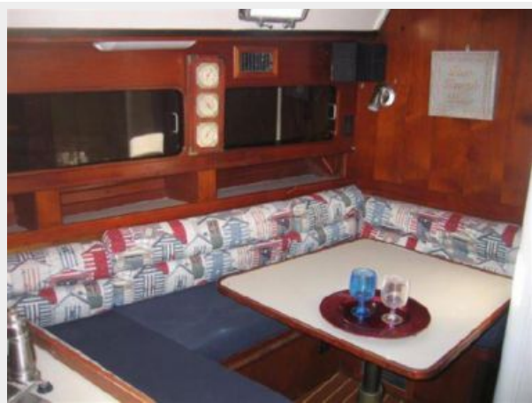
U Shaped Saloon Convertible Table/Berth