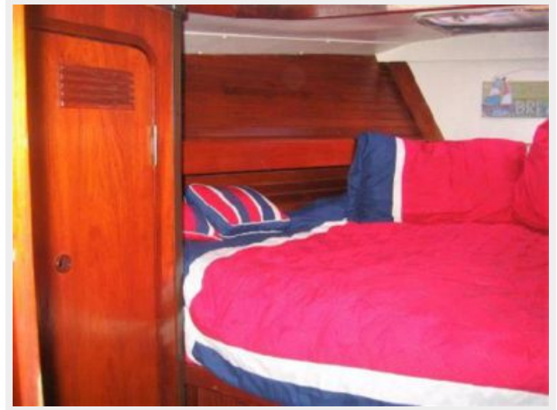
Large & Comfy Aft Cabin Starboard