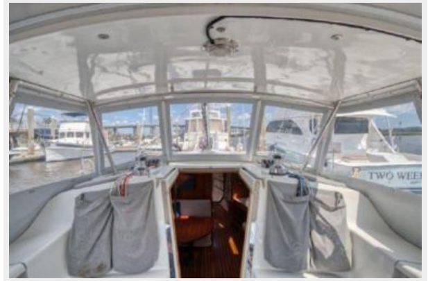
Hard dodger with new panels