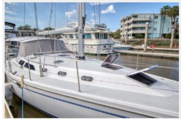
Upgraded Catalina double anchor rollers