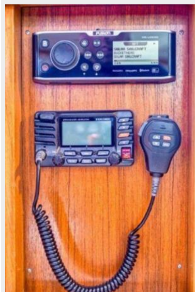
Fusion radio and VHF