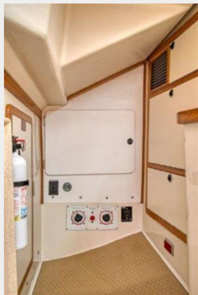
Galley pantry area and engine access