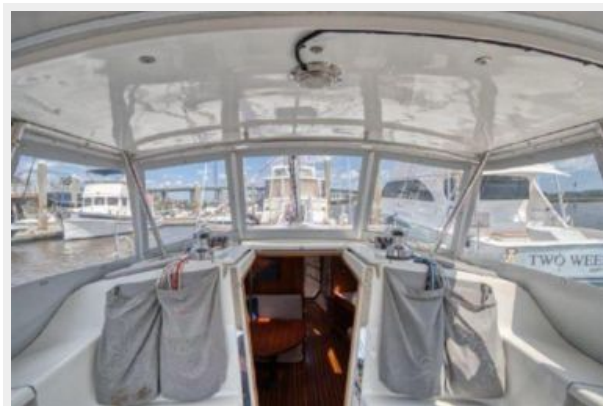
Hard dodger with new panels