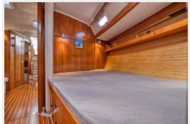
Owner's cabin berth looking aft