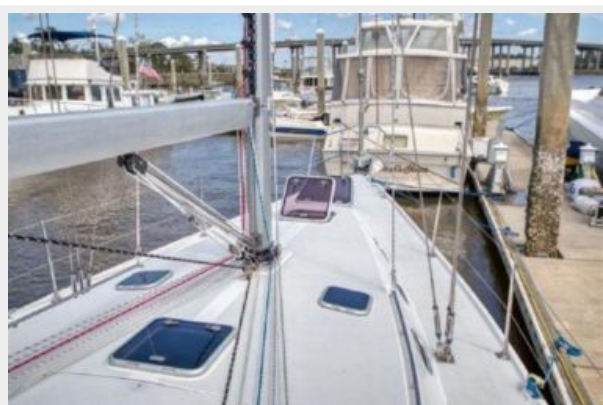
New sails are on order from North Sails