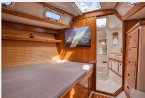
Owner's cabin berth looking forward