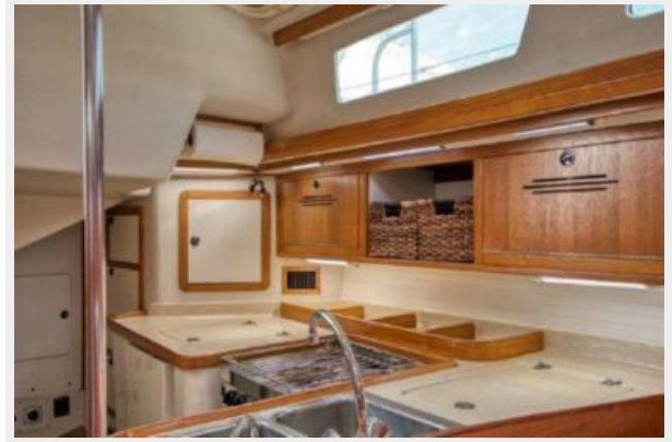
Large galley and pantry