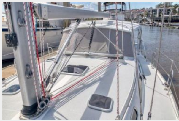
New running rigging