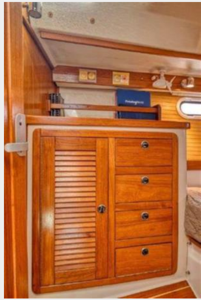
Aft cabin storage