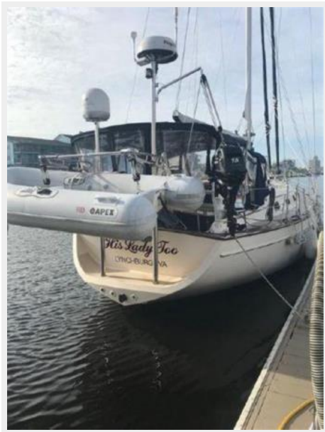
Well organized transom