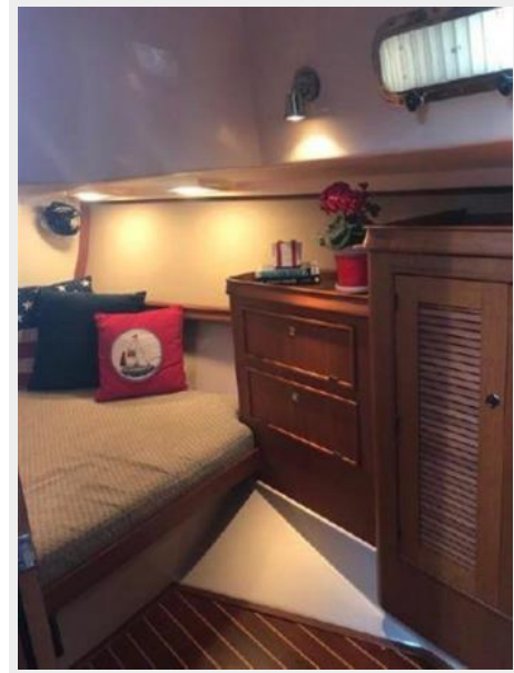
Aft cabin with plenty of storage