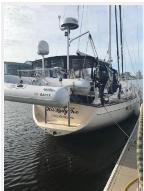
Well organized transom