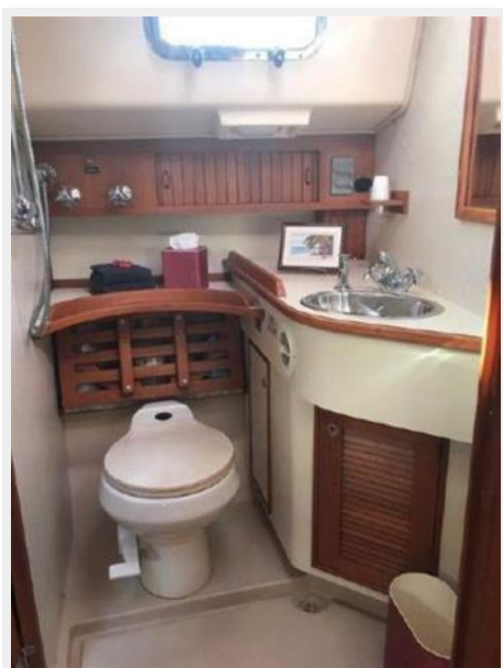
Aft vacuflush head and shower