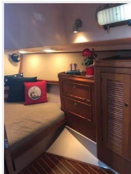
Aft cabin with plenty of storage