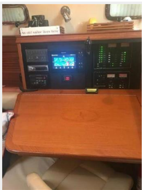
Chart Table and Electric Panel