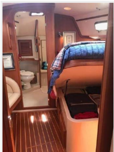
Storage and safe under fwd berth