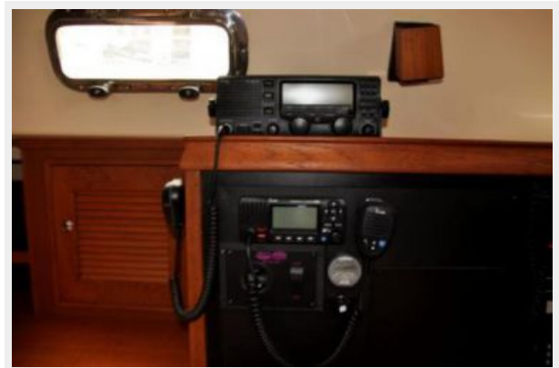
SSB and VHF radios