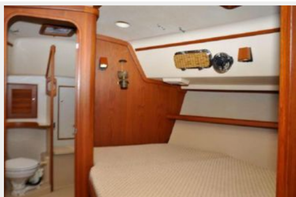
Owner's suite looking forward