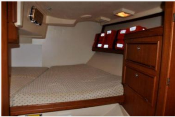
aft cabin - looking aft