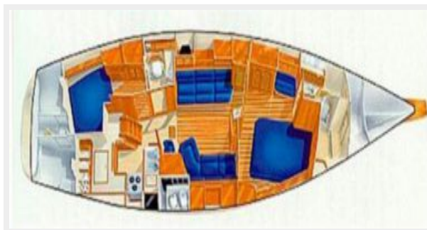
IP420 accommodation plan