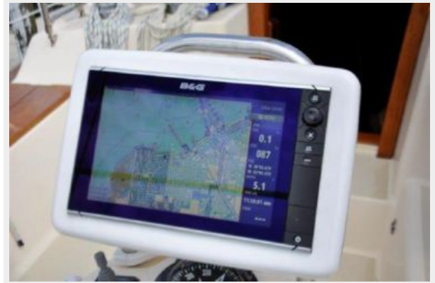
new B&G 12" Zeus Chartplotter