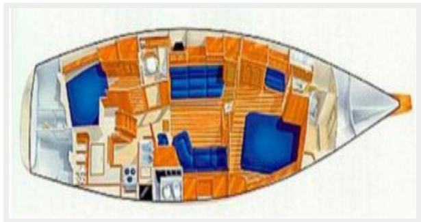
IP420 accommodation plan