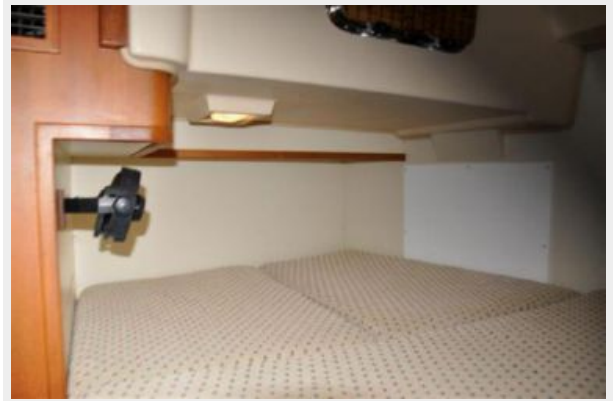
aft cabin - looking inboard