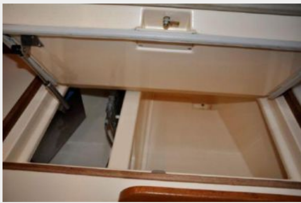
icebox with divider and plate freezer units and spillover fan