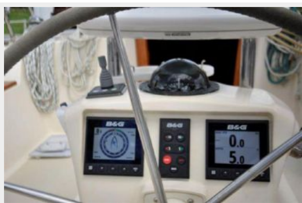
new B&G Triton displays and autopilot control