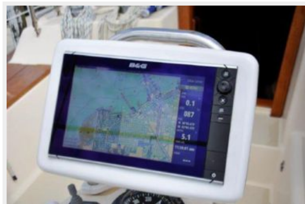
new B&G 12" Zeus Chartplotter