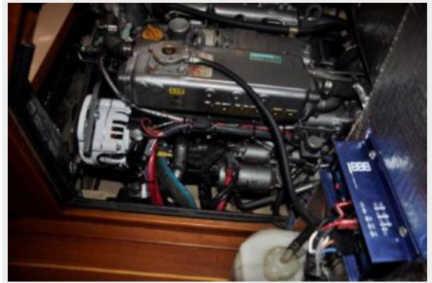
engine, port side view