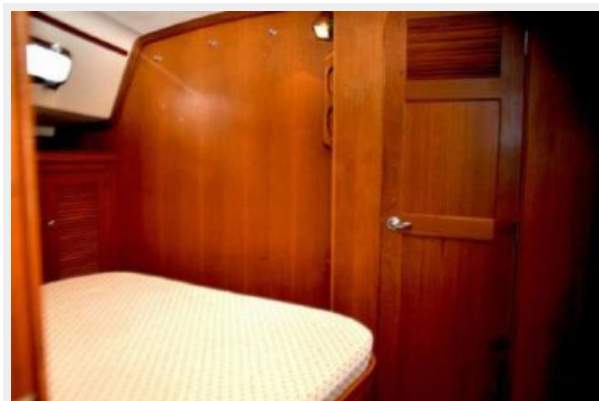
Owner's suite looking aft