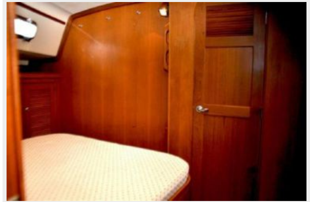
Owner's suite looking aft