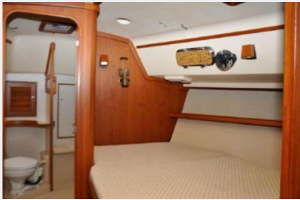
Owner's suite looking forward