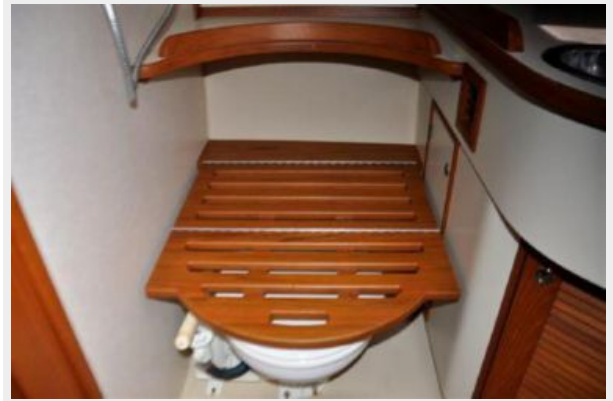
fold down shower seat in aft head