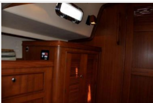
aft cabin - looking forward at lockers and storage