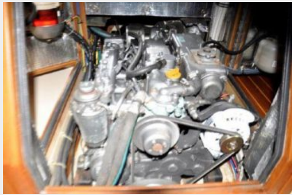
Yanmar engine w/3,000 hours