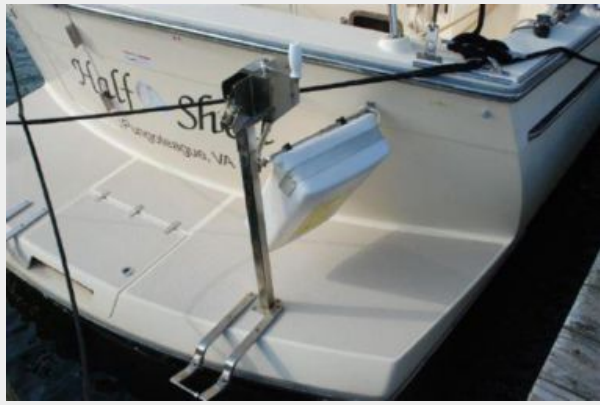
Sea Wise Davits