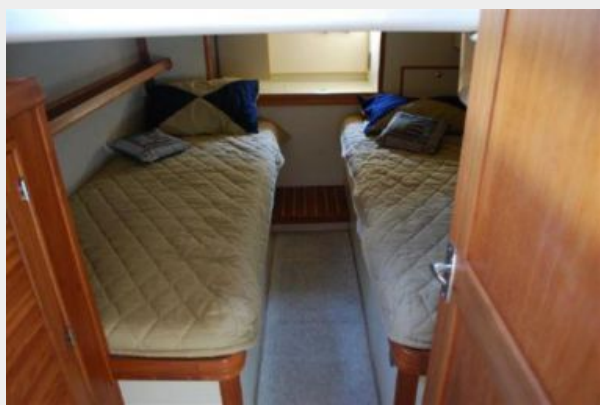
Double Berth Aft Cabin