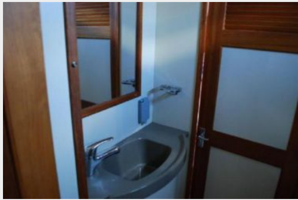
Vanity in Head