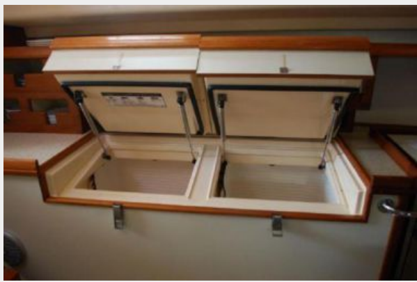
Refrig & Freezer