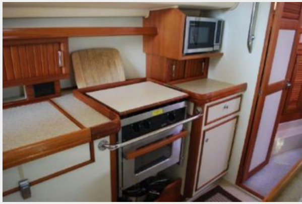
Refrig, Stove & Microwave