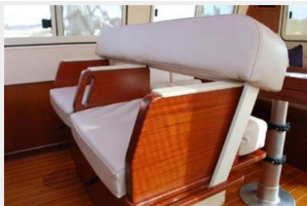
Dual Helm Seats