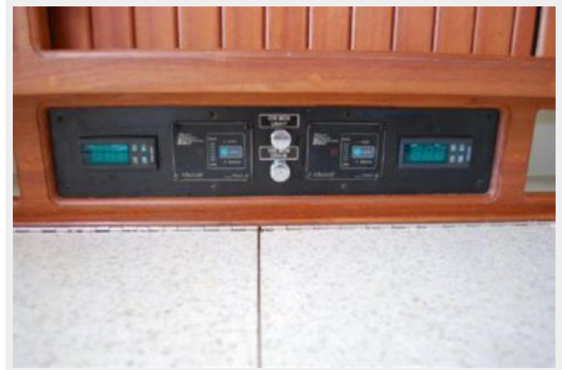
Refrig & Freezer Digital Controls