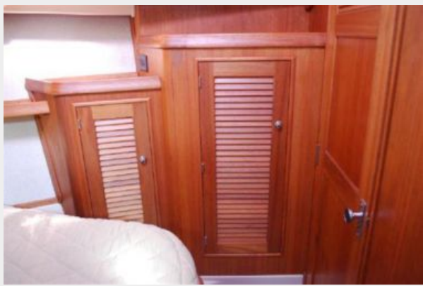
Fwd Cabin Storage