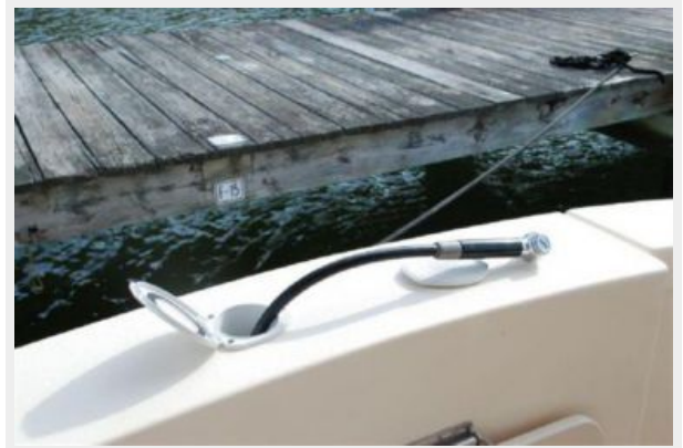
Cockpit Hot & Cold Water Shower