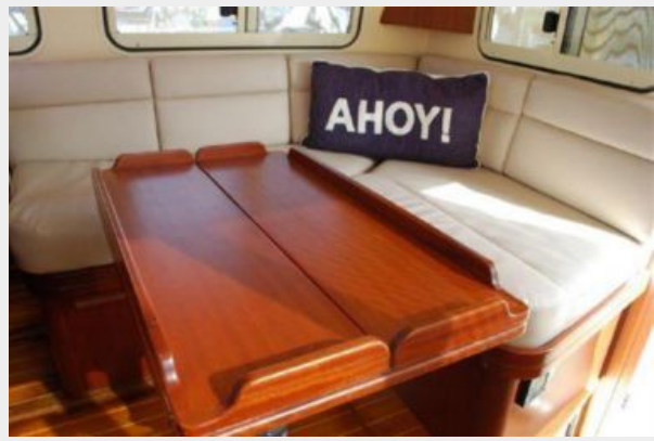
Pilot House Table