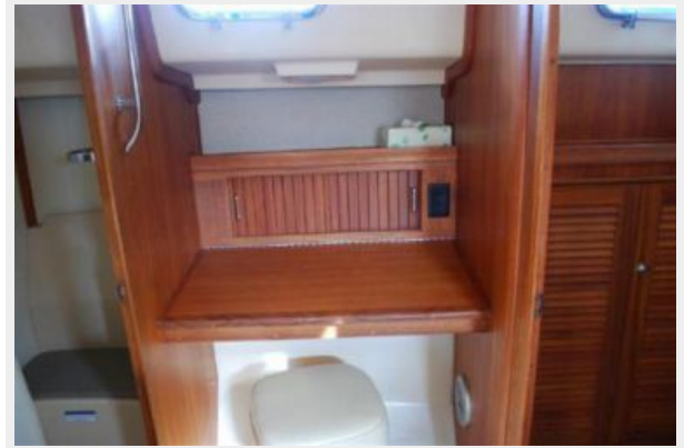
Desk with Adjustable Seat