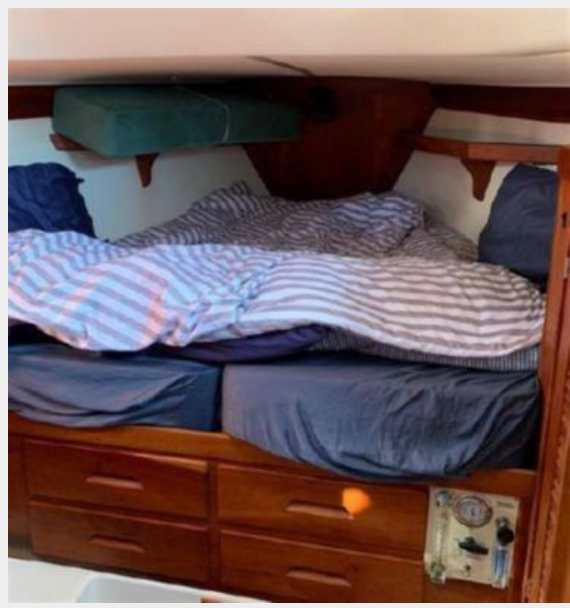
Tartan 4100 on land