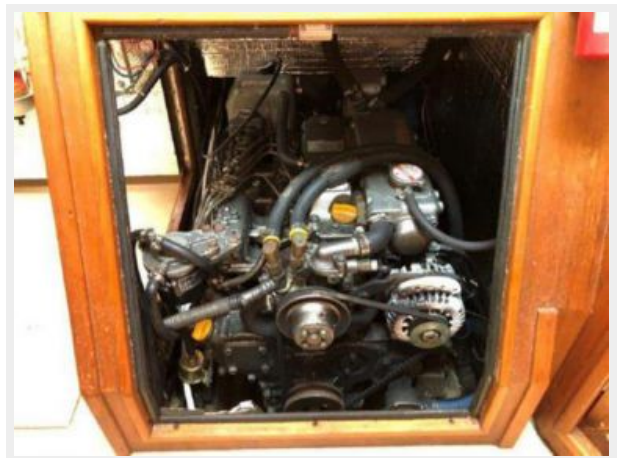
Excellent engine access