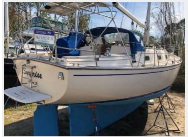
On-the-hard - April 2019