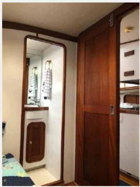
Guest Cabin Ensuite Head Entry