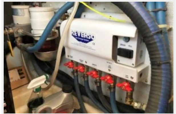
Aft of Starboard Engine