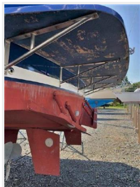
Swim Platform Structure