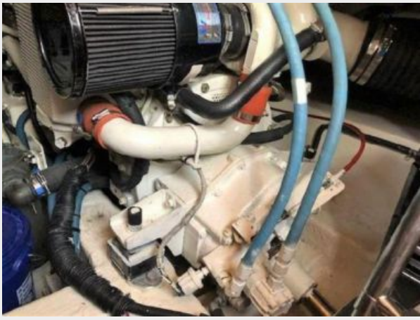
Aft of Starboard Engine 2