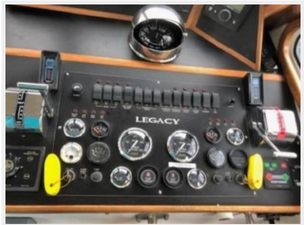
Engine Panel Details