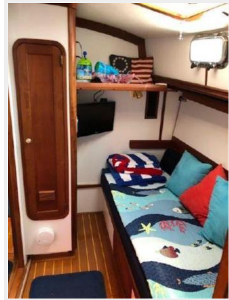
Comfy Guest Cabin