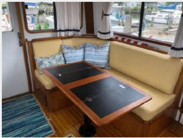
PH Dining Area