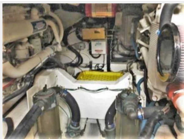
Forward Engine Compartment