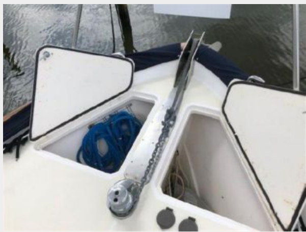
Anchor Well, Windlass