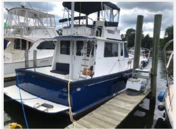
Ladder to Flybridge & Wide Side Decks