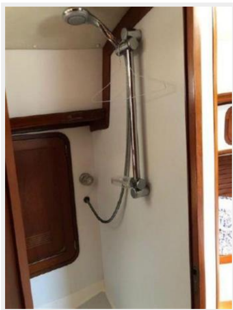
Owner's Cabin Shower Stall w/glass door