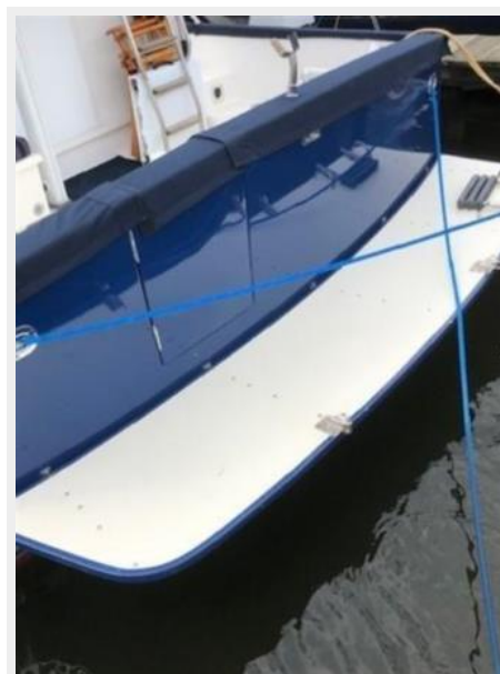
Swim Platform & Transom Gate