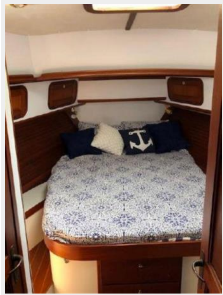
Owner's Large, Comfy Island Berth