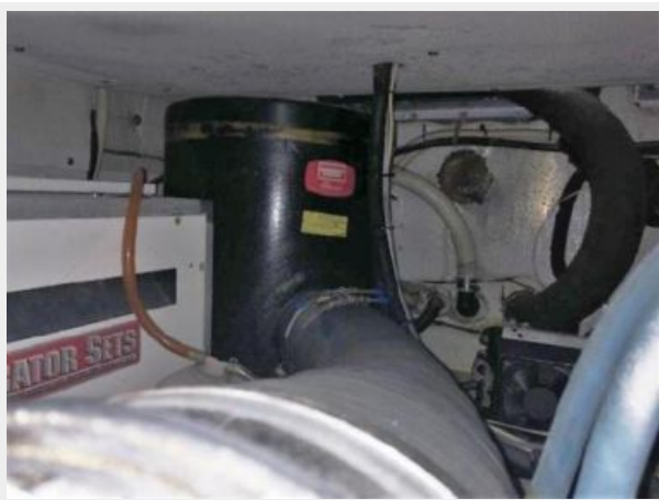
Gen behind Port Engine