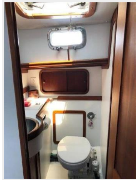
Owner's Commode & Sink