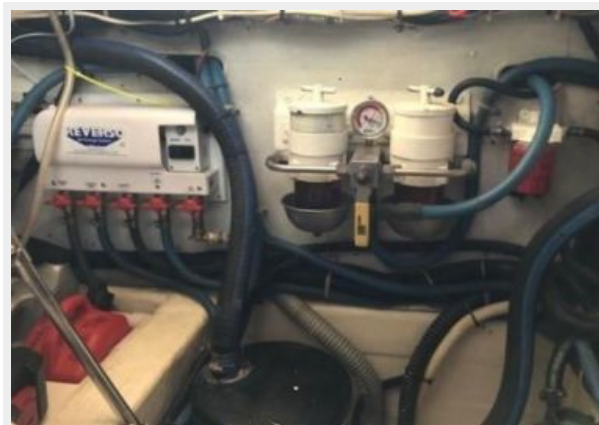
Aft Engine Compartment with Reverso