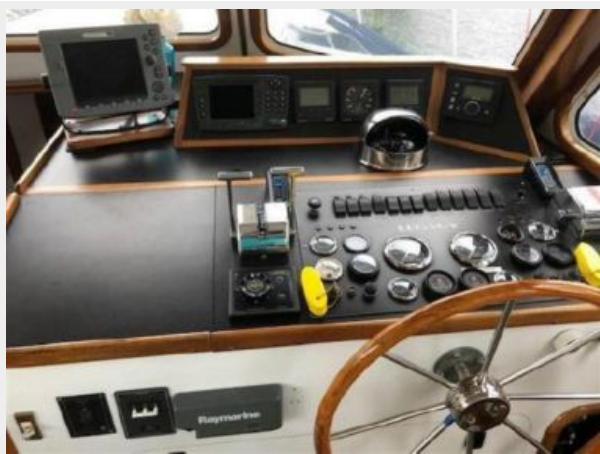
Lower Helm Engine/Instrument Panel