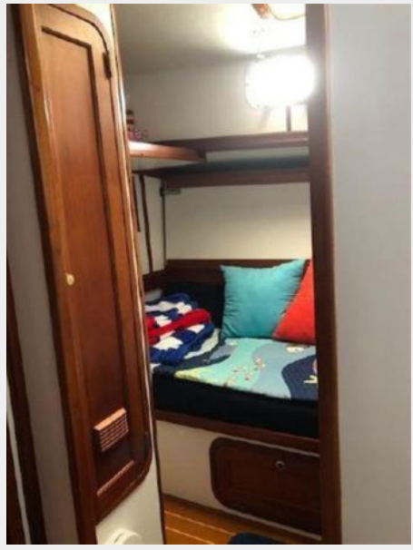
Starboard Side Mid-Ship Guest Cabin