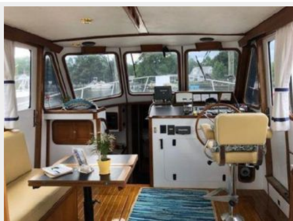
Pilot House - Lower Helm