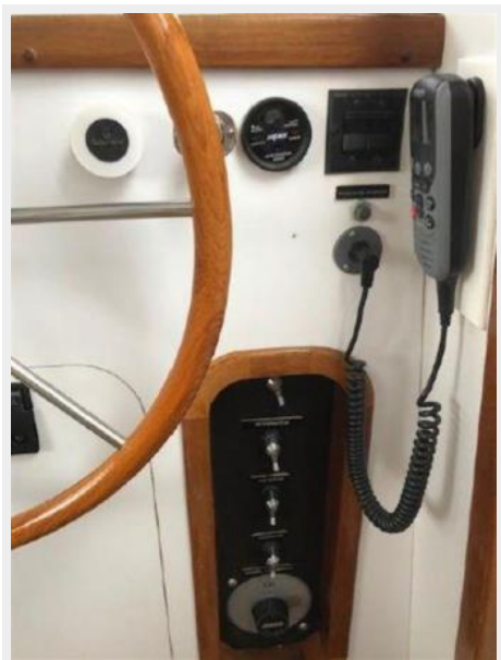
VHF Radio within easy reach of helm