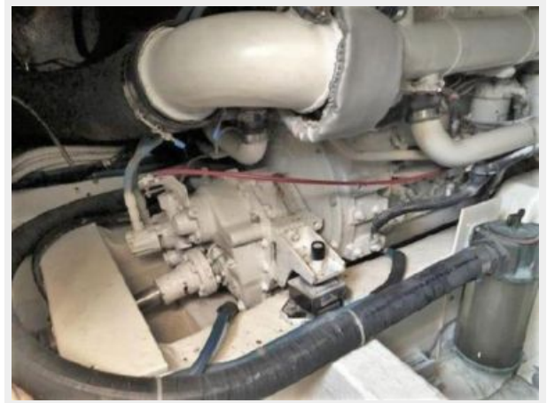
Gen Muffler, Intake & Plexiglas Floor