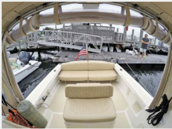
Engine Box and Cockpit Seating