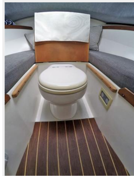
Тесма Fresh Water Head