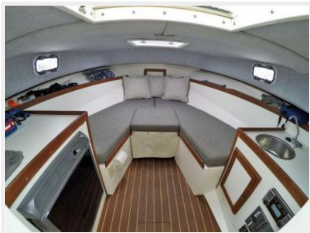
Interior Looking Forward