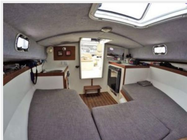
Interior Looking Aft