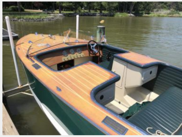
1 Miss Reagan 2003 20' Cherubini