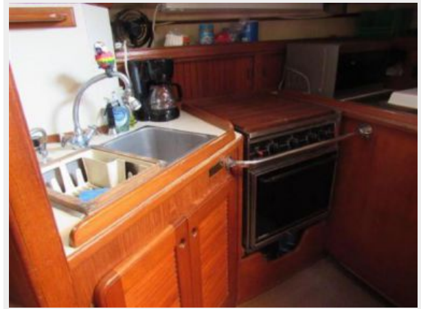
Galley sink, stove with oven