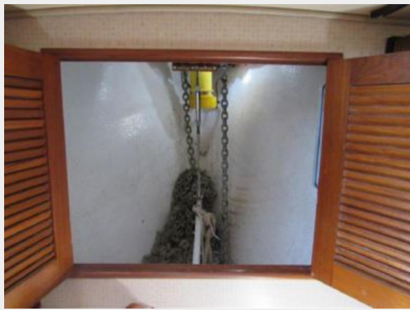
Divided Anchor Locker