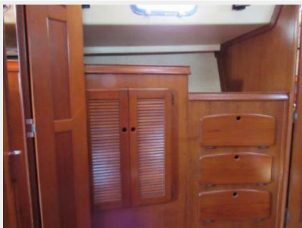
Fwd Cabin Hanging Locker & Bureaus