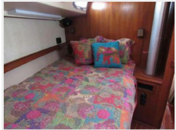
Double berth fwd cabin