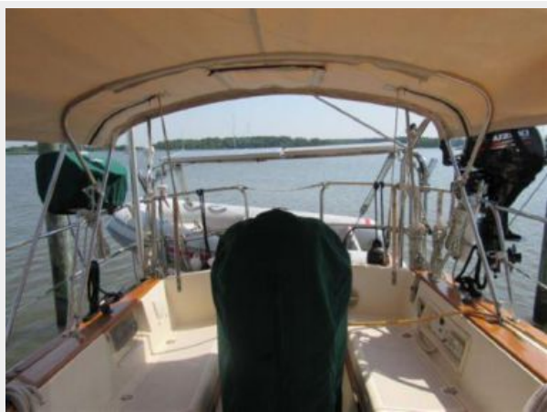
Cockpit view aft