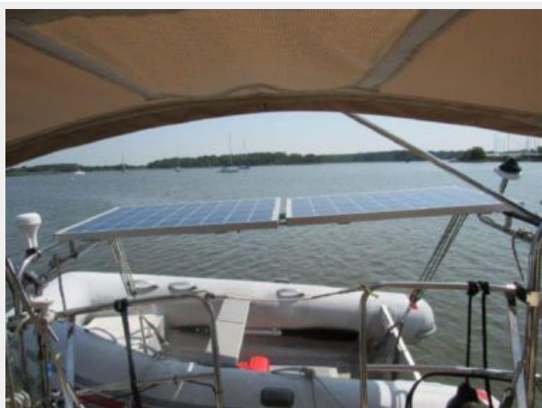
Dinghy on davits and solar panels