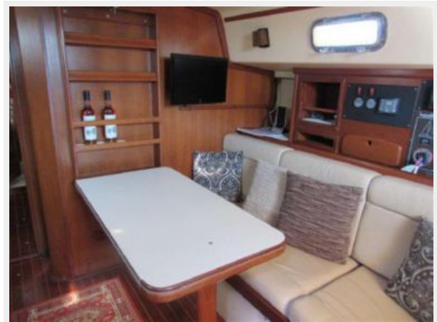
Fold away dinette table