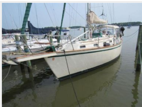
In her slip