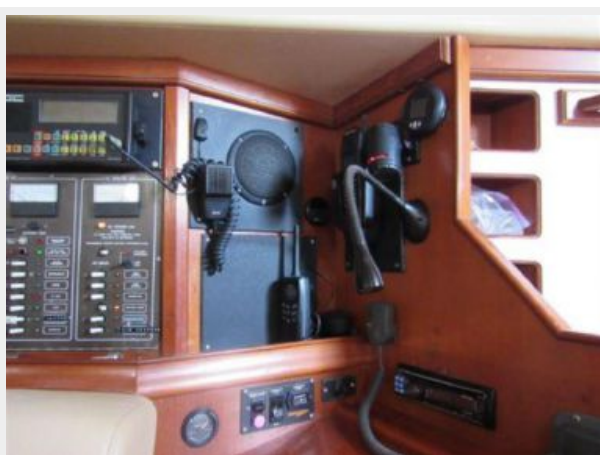
Chart Table View