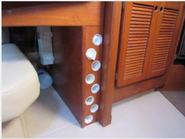
Custom Paper Chart Storage