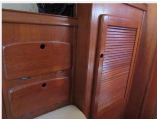
Aft cabin hanging locker and storage