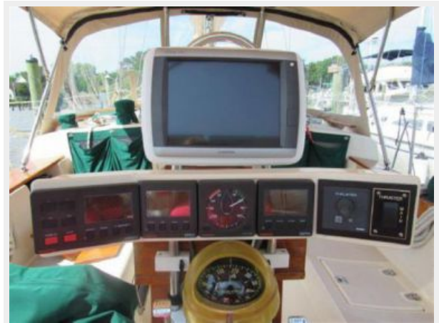
Electronics at helm