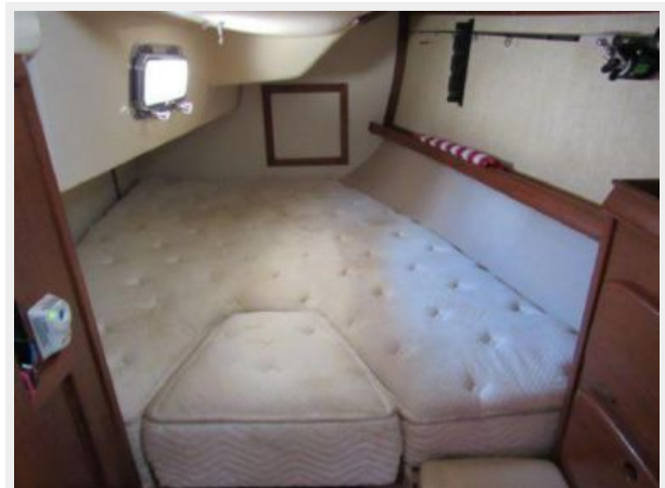
Custom Handcraft Mattress Company mattress aft cabin