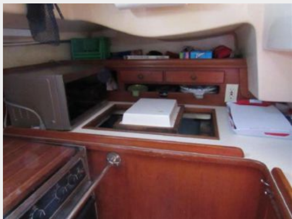
Galley looking aft