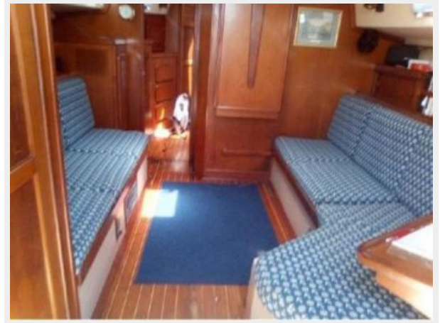
Main Saloon from the companionway