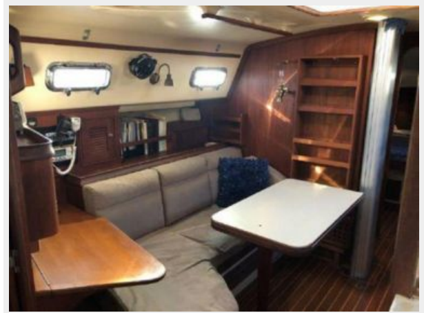
Dining table and storage