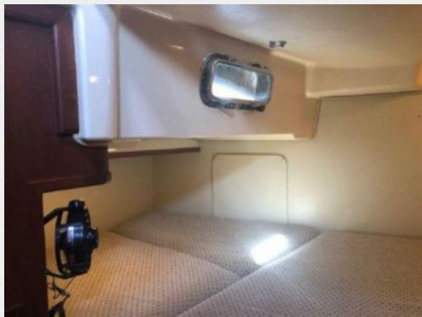
Aft stateroom berth