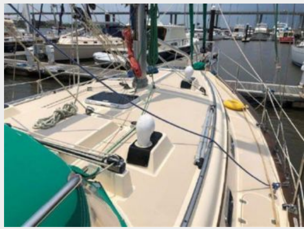
Wide side decks with stainless steel handrails