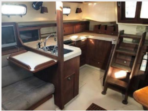
Galley and a folding table