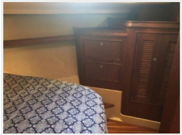
Fwd stateroom starboard storage