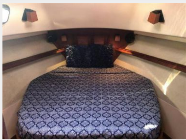
Double island berth in the forward stateroom