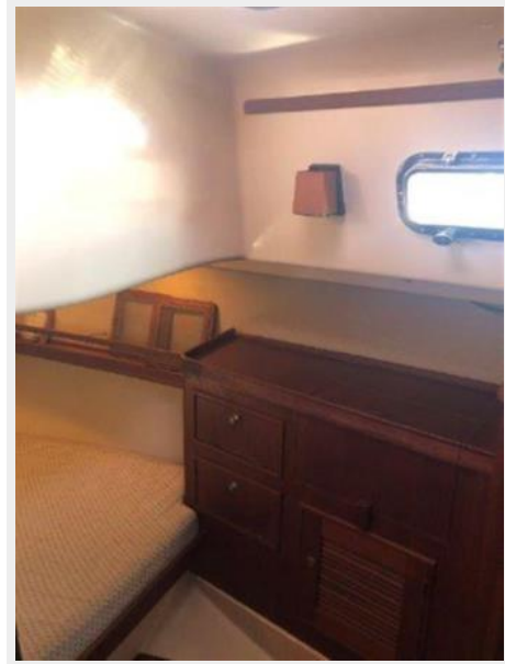
Aft stateroom storage