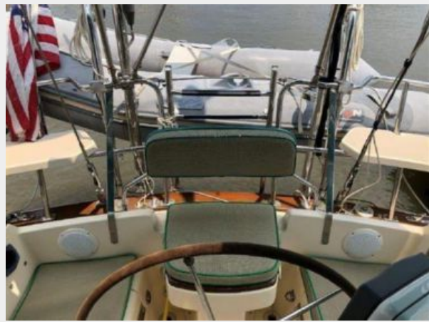
Helm seat with removable back