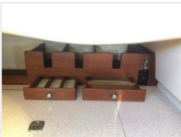
Plate and cutlery storage