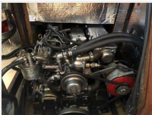
Super clean engine