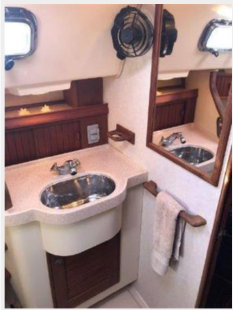
Head mirror and vanity