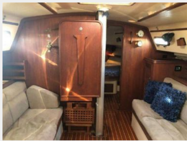
Fold up table and a small coffee table