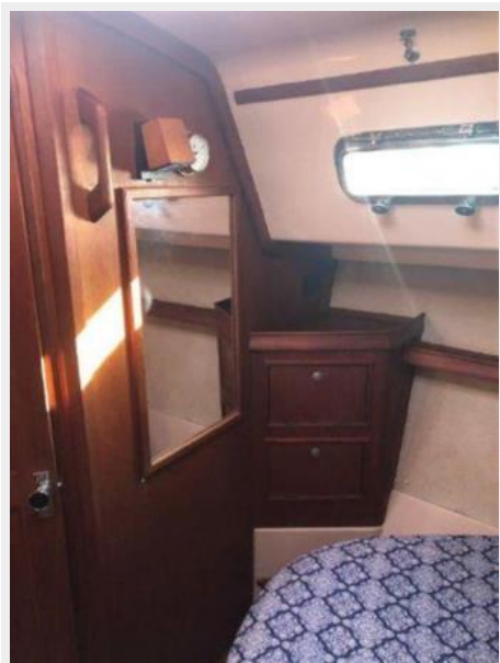
Fwd stateroom port storage