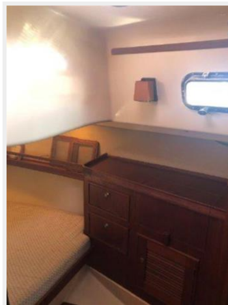
Aft stateroom storage