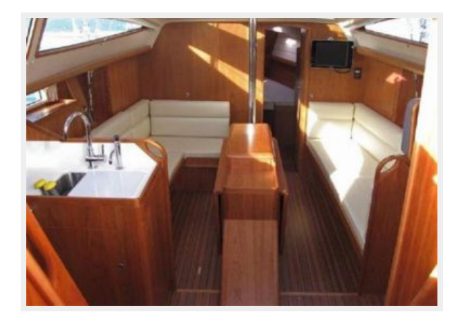
Salon port settee