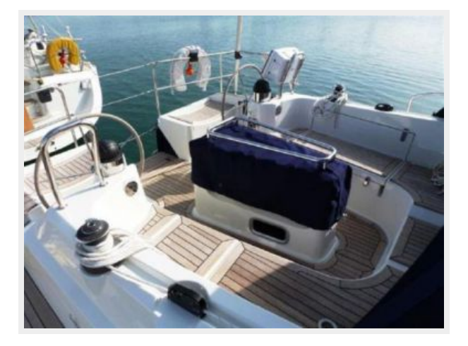
Southerly 38 sistership cockpit