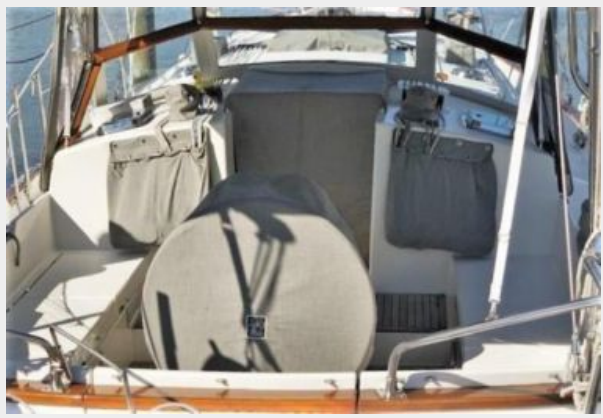
Looking at Companionway Under cover