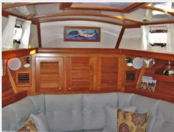
Huge Saloon Seating Area