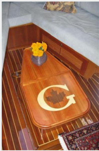
Beautiful Inlaid Saloon Table