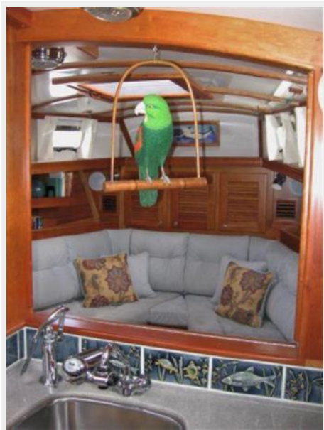
Looking into Forward Saloon