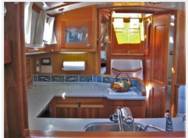
Galley from Forward Cabin