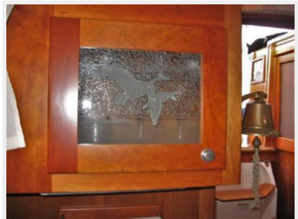
Etched Glass Galley Cabinet Door