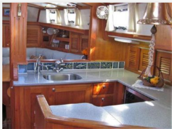
Looking Forward thru Galley