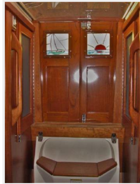
Custom Lead Glass Cafe Doors