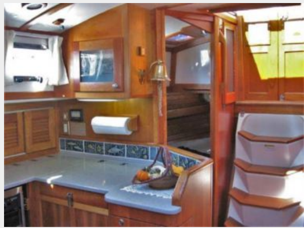
Looking Aft over Galley