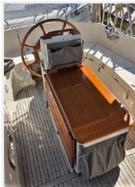
Practical & Gorgeous