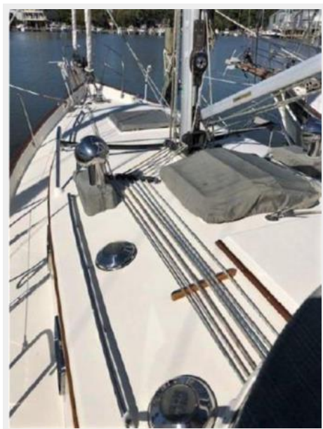
All Lines Led Aft