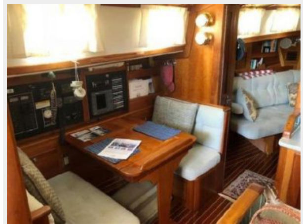
Cozy Dining & Navigation Table