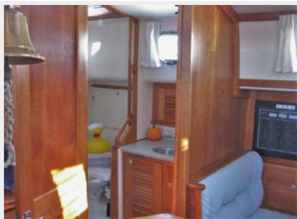
Looking into Head & Shower Area