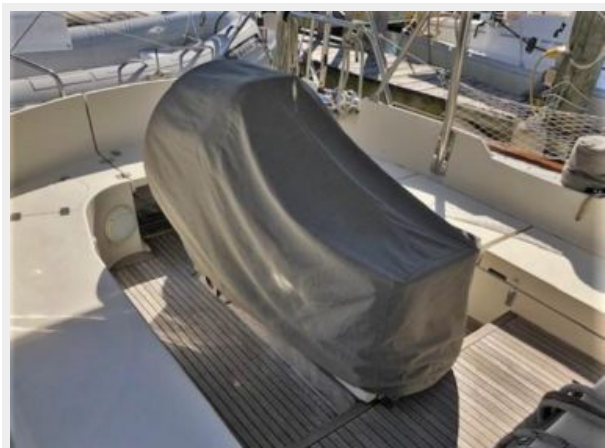
Binnacle/Cockpit Table Cover