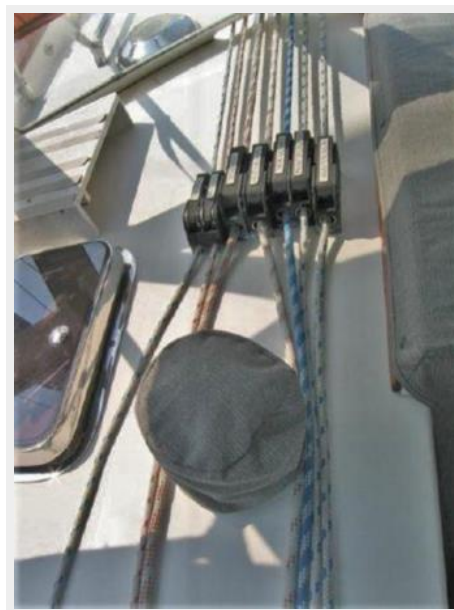
Port Side Line Organization