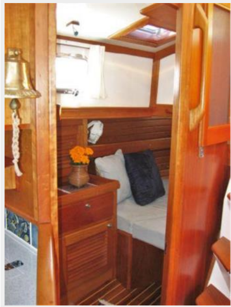
Aft Cabin Entry