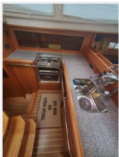
Galley with sink