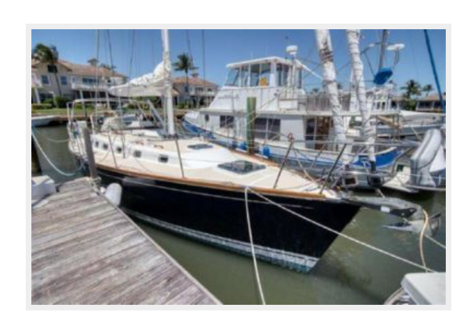
Drop down swim platform