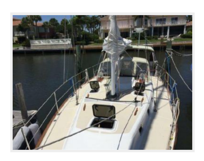
Control lines led to the cockpit