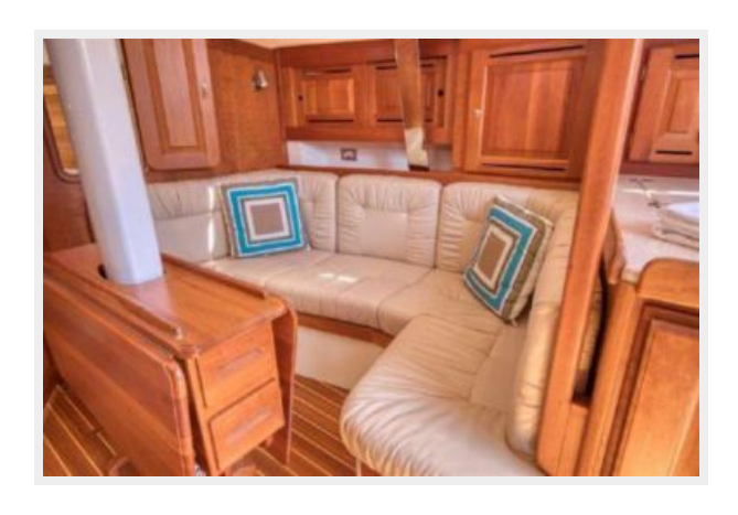
Fold up dining table