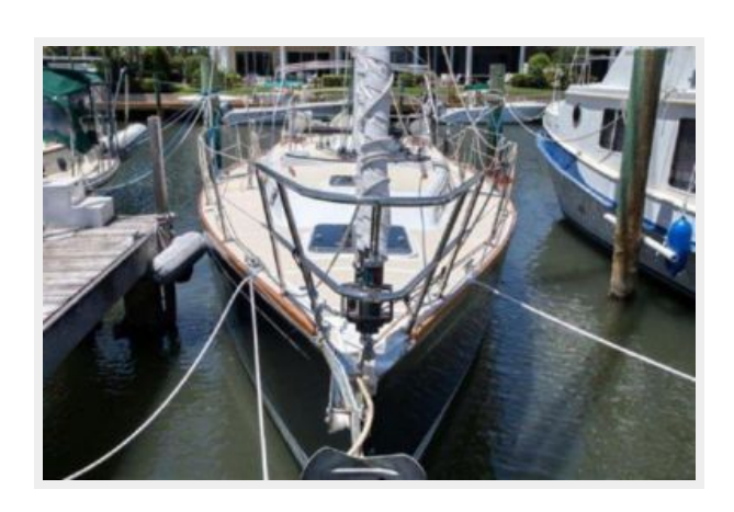
Wide side decks