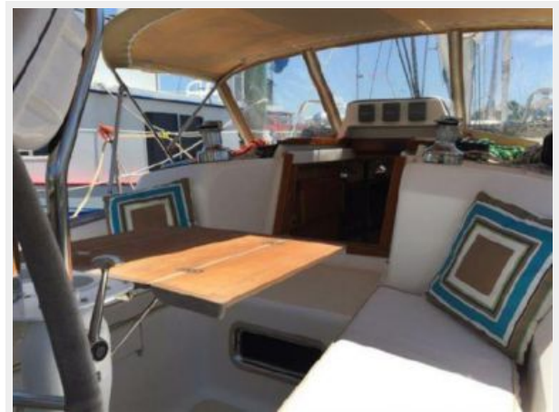
Fold up cockpit table