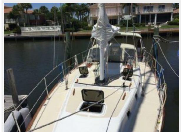
Control lines led to the cockpit