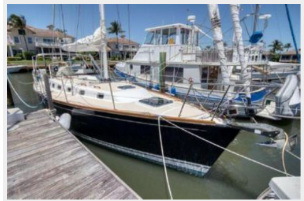
Drop down swim platform