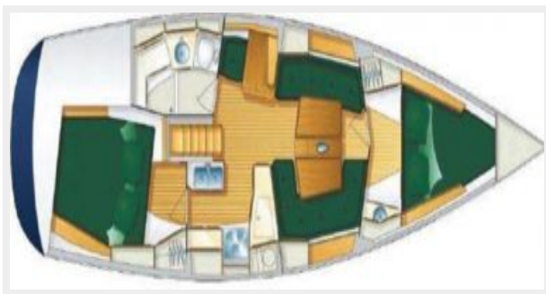
Tartan 3700 Layout