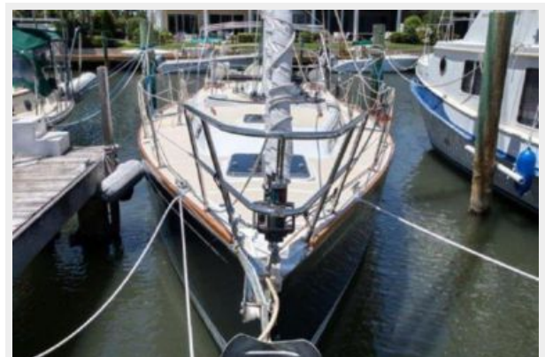
Wide side decks