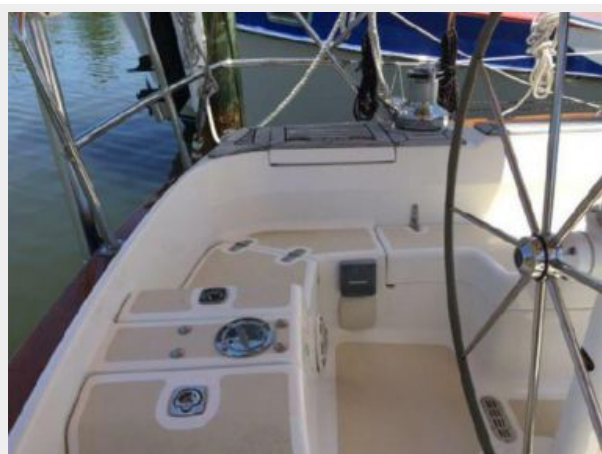
Helm seat and storage