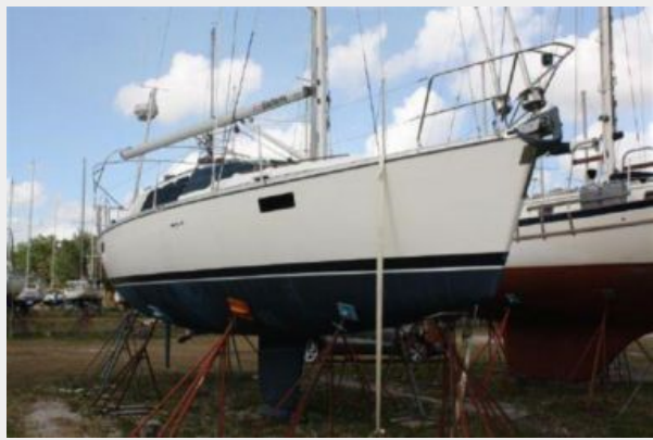
Starboard Forward Quarter