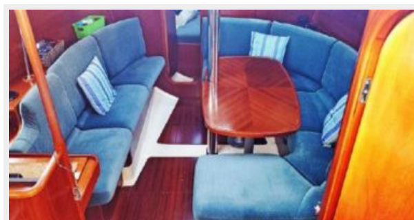
View from Companionway