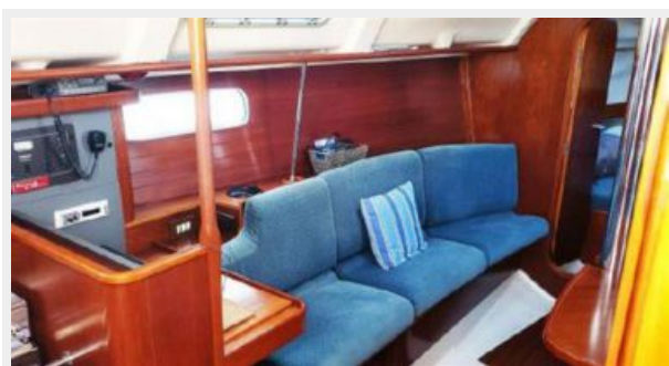
Port Side Settee