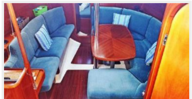
View from Companionway