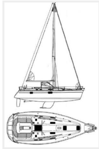
Sail and Deck Plan