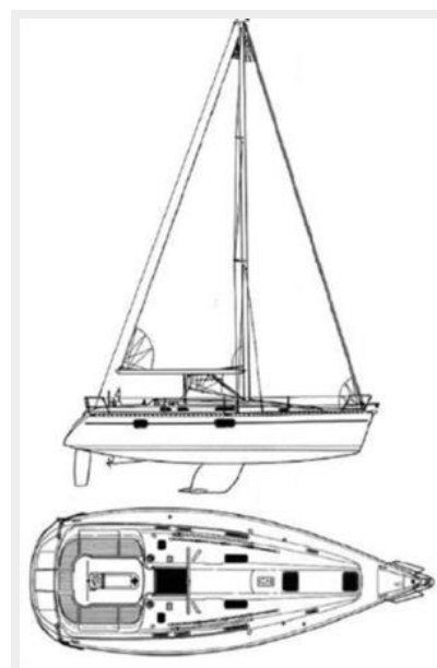
Sail and Deck Plan