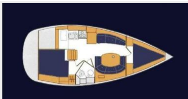
Beneteau 351 Two Cabin Layout