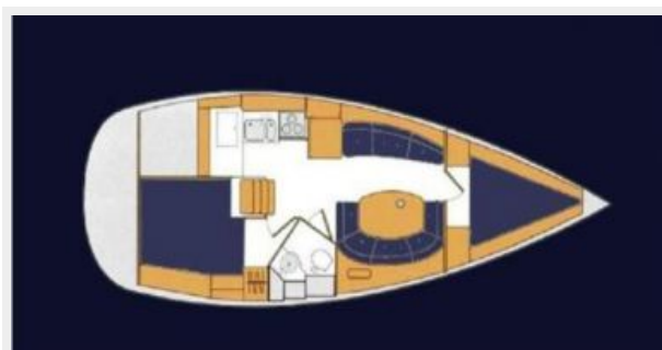
Beneteau 351 Two Cabin Layout