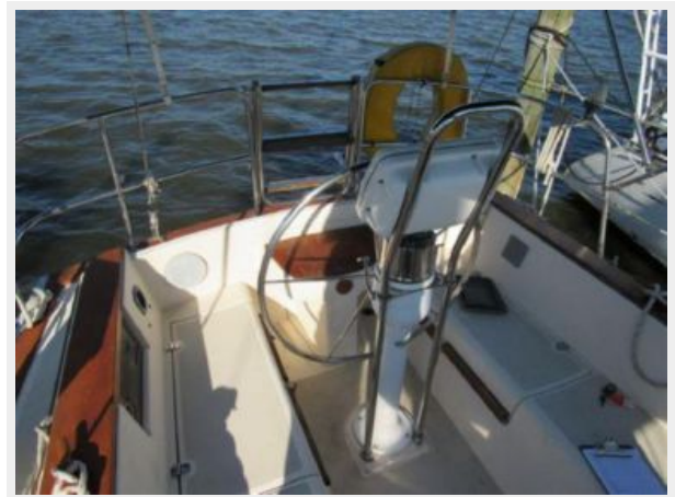
Pedestal Mounted Steering