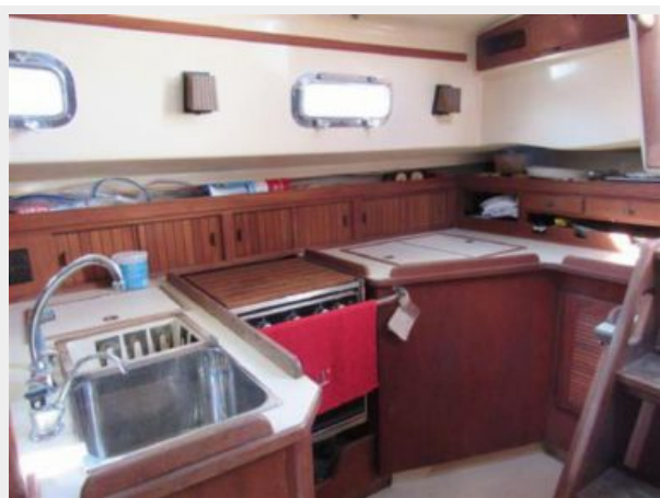
Galley With Good Ventilation