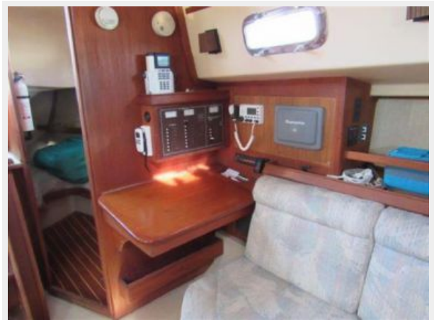
Chart Desk Looking Aft