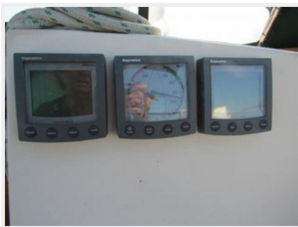
Knot, Depth, WD/WS on Bulkhead