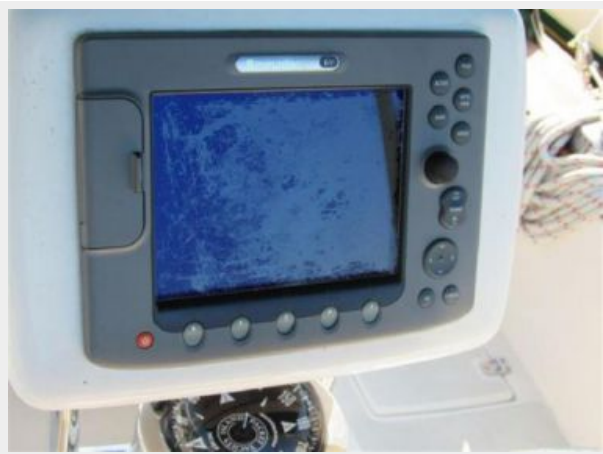
Radar/Chartplotter At Helm