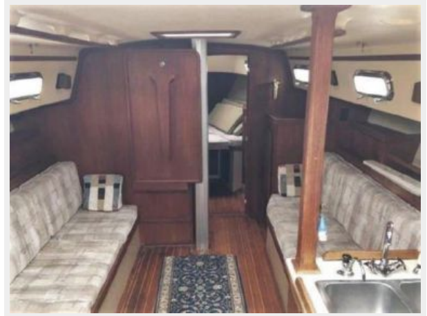
Main Saloon looking Forward