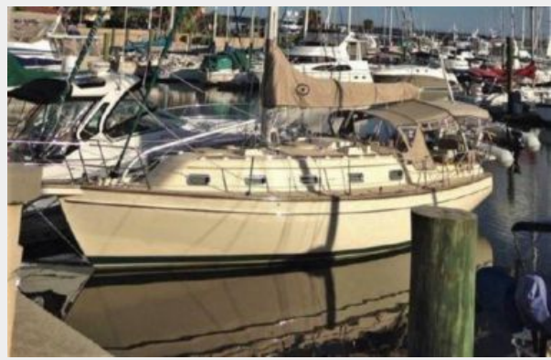
At Dock on Port Side