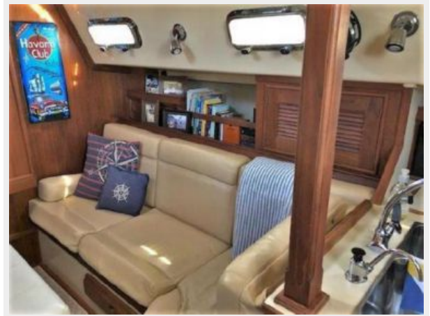
Starboard Side Saloon