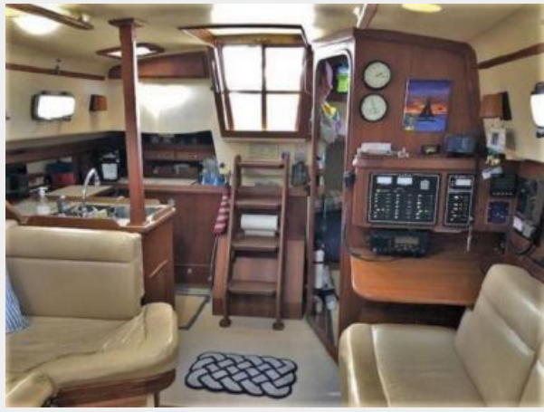
Looking Aft to Companionway