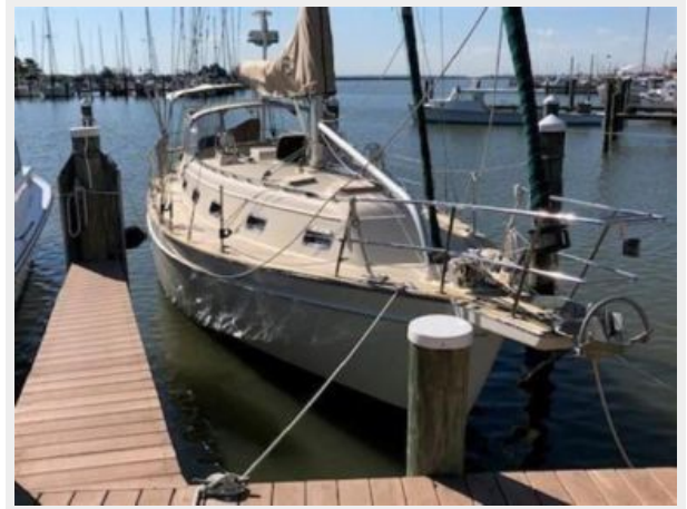
Starboard Side at Dock