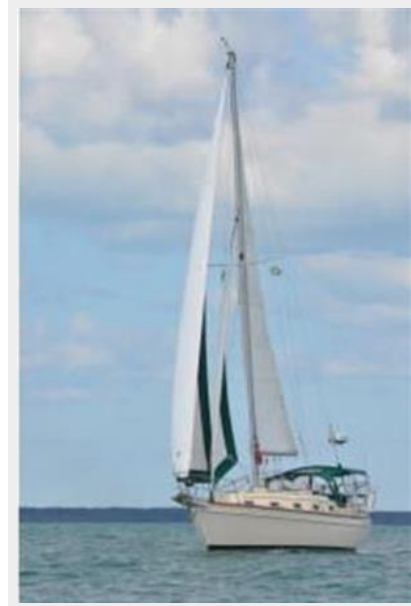
Port Tack Close Reach