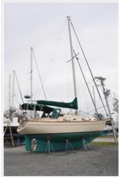
Starboard Side on Land