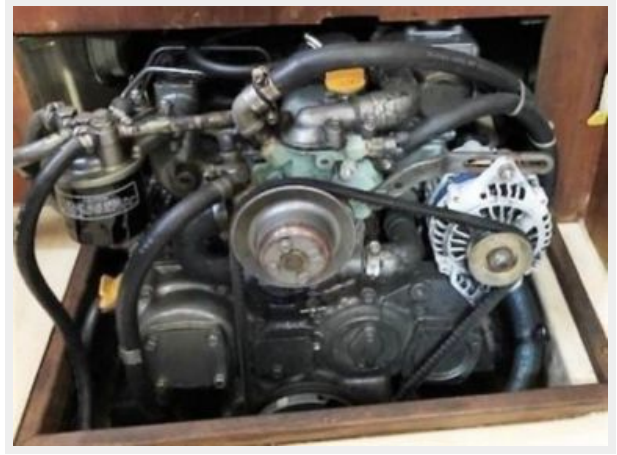
Easily Serviced Engine