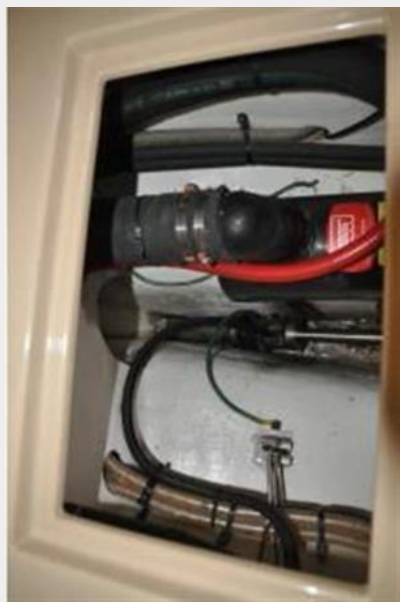
Dripless Stuffing Box