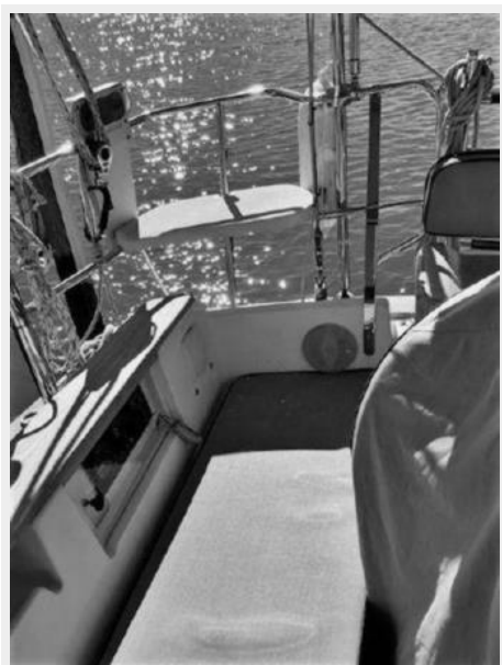
Starboard Side Cockpit