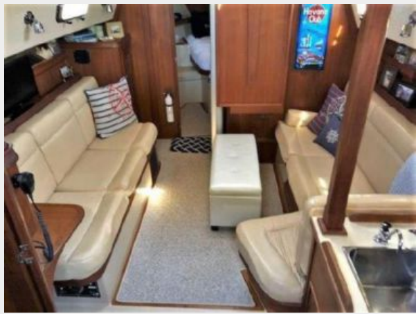
Looking Forward thru Saloon