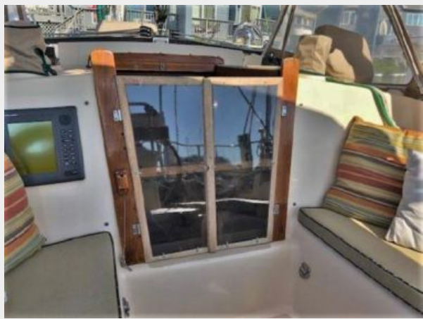
Cafe Style Companionway Entry