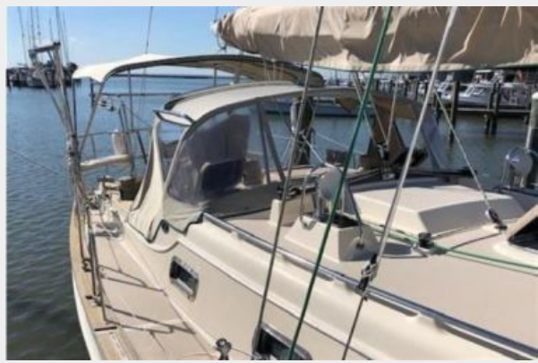
Starboard Side Aft Detail