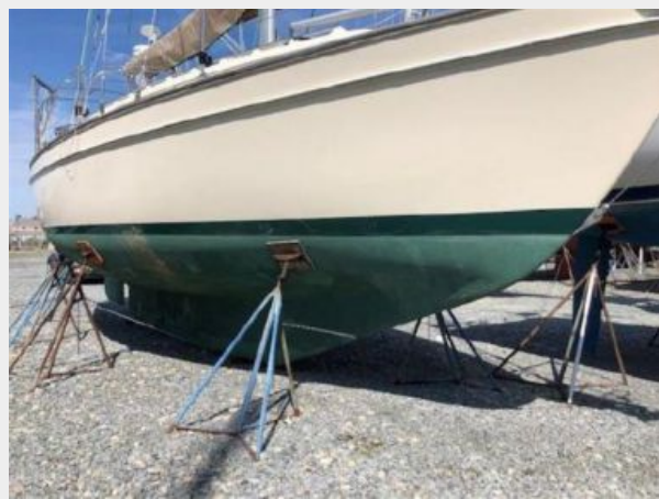
Starboard Side w/Optional Rub Rail