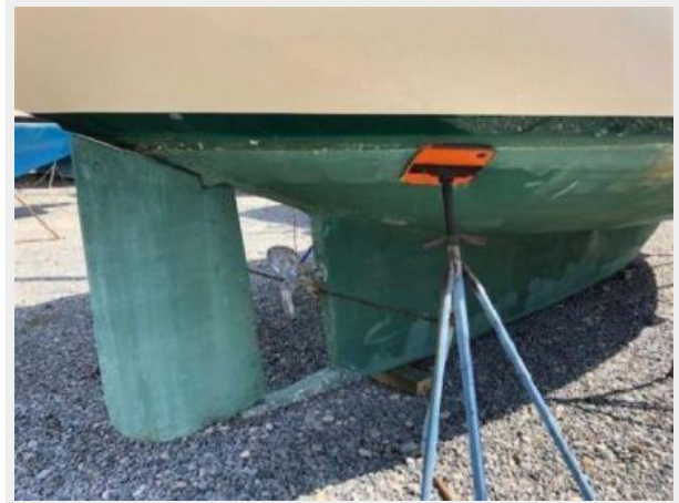
Keel & Spade Rudder