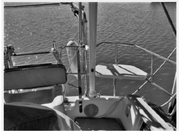
Stern Rail Seats