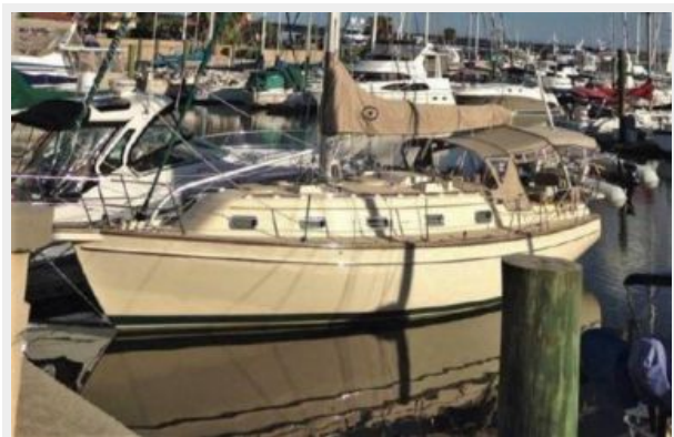
At Dock on Port Side