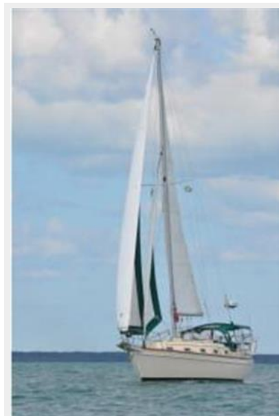
Port Tack Close Reach