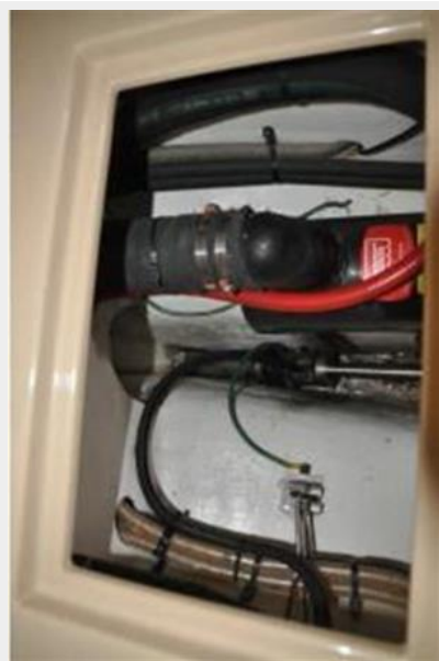
Dripless Stuffing Box