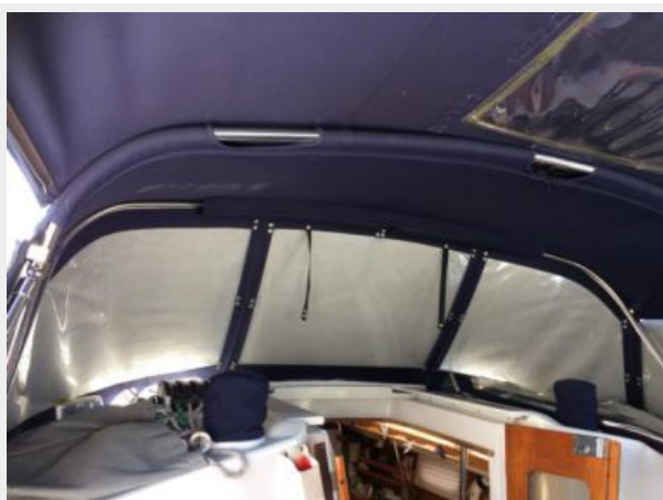
Dodger w/ window covers, Bimini and full enclosure