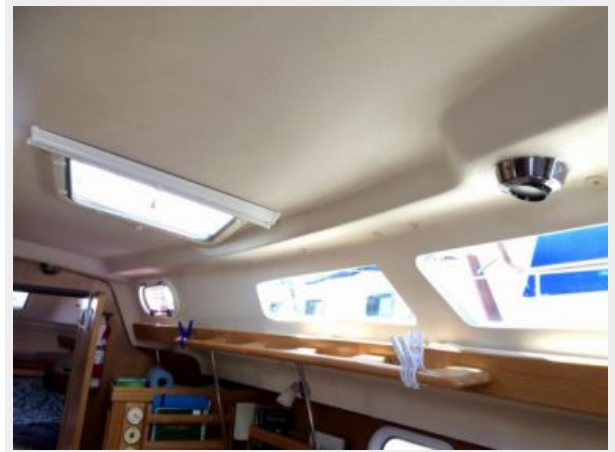
Hatch and Ports