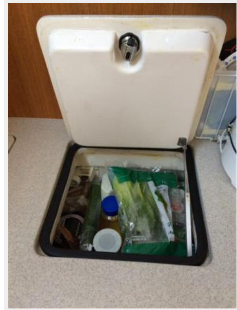
Countertop Access to Fridge