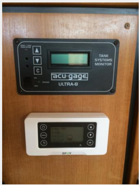
Tank Guage and Efoy Control Panel