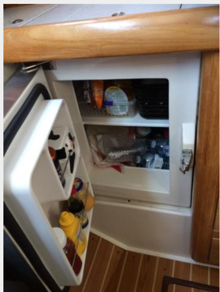
Front access to Fridge