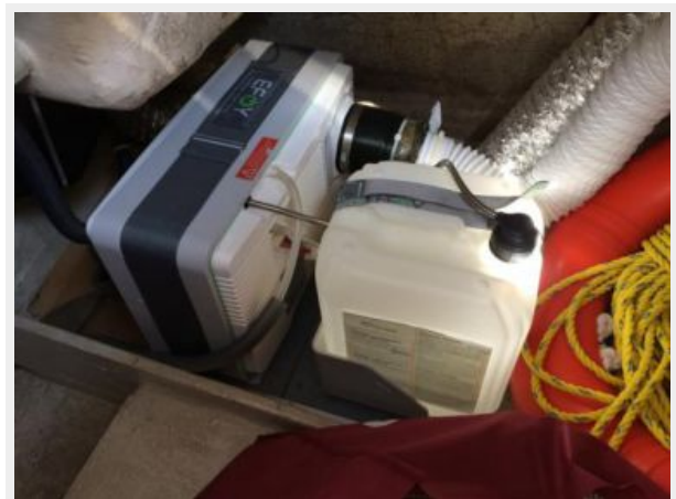
Efoy 210 Fuel Cell Generator