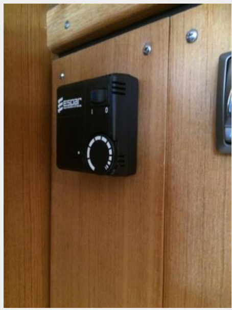
Espar Hydronic Diesel Heat