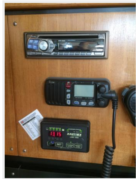
Nav Station VHF w/ remote, Stereo and Inverter Panel