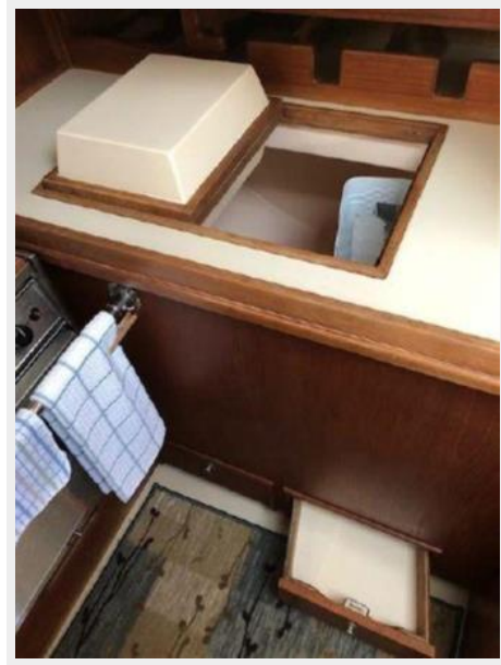
Table Down & Ready to Entertain