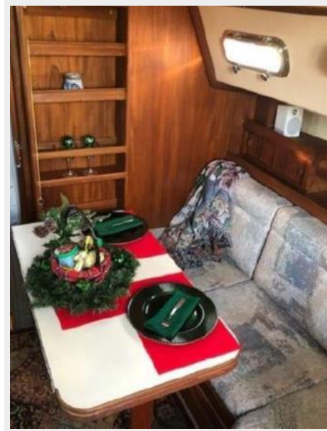
Table & Ready to Entertain