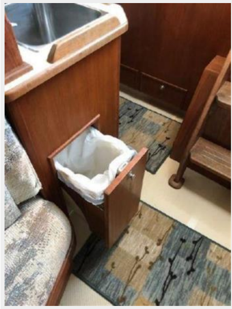
Real Pull-Out Trash Can