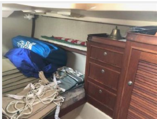
Aft Cabin Entry w/Winter Storage