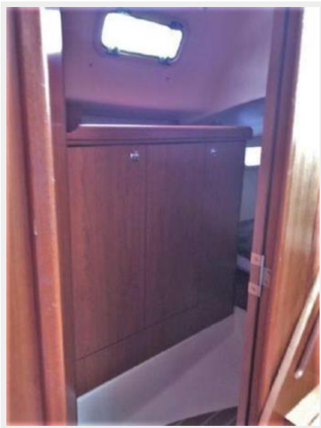
Lockers at Aft Cabin Entry