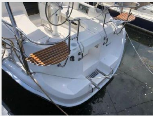
Stern Rail Seats & Swim Platform