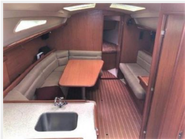
Looking Forward from Galley