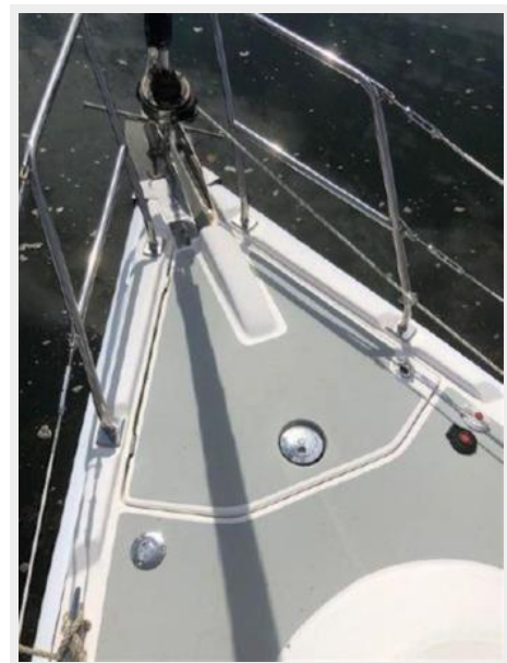
Bow with Windlass