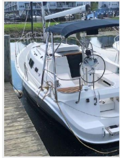
Port Side Aft Quarter