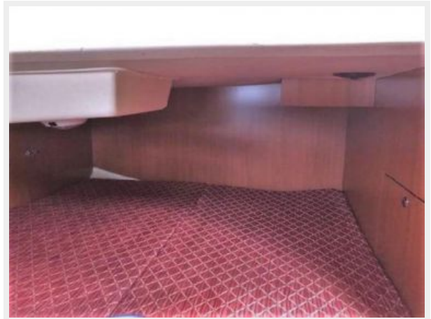
Large Athwartship Aft Berth