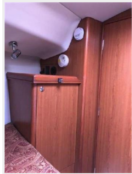
Vee Berth Hanging Locker