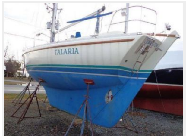
On the hard- Port Side