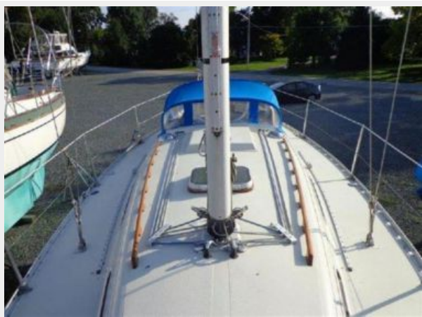
Deck looking aft