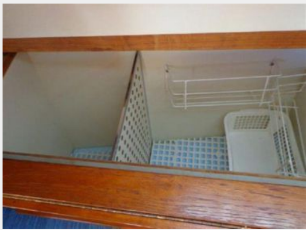
Custom ice box