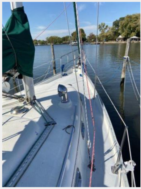
Starboard side deck