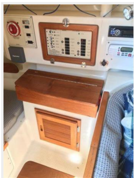
Compact Nav Station